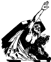
JULES VERNE'S TOMBSTONE AT AMIENS PORTRAYING HIS IMMORTALITY