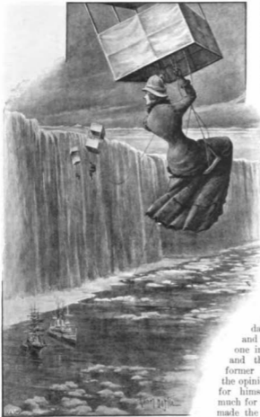
"She had looked over the great Ice Wall of the South."

The British Government and the Royal Geographical Society of London were sending out a couple of vessels—one a superannuated whaler, and the other a hopelessly obsolete