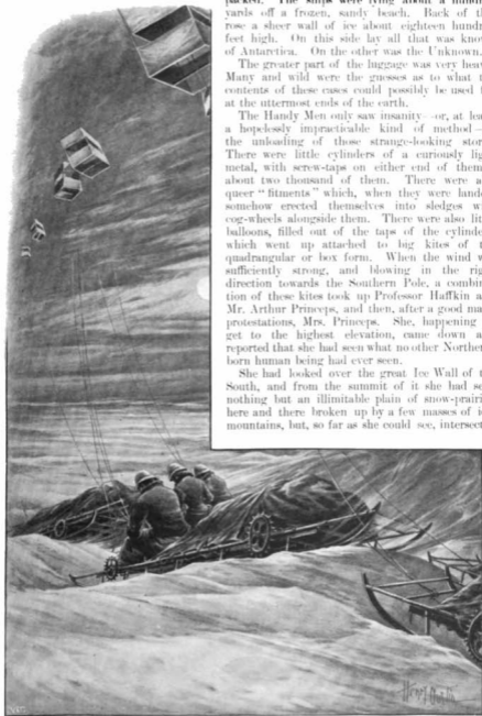
"It was more like a twelve-hundred mile switchback ride than a Polar expedition."

She had looked over the great Ice Wall of the South, and from the summit of it she had seen nothing but an illimitable plain of snow-prairies, here and there broken up by a few masses of ice-mountains, but, so far as she could see, intersected