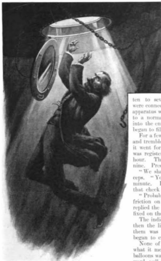
"He hung for a moment to the edge with his hands, and let go."

but also for their flight southward, if happily they found favourable winds to carry them back to the confines of civilisation. These he kept to himself. He had the best of reasons for doing so.