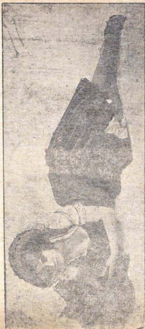
ONE OF THE GIRLS,