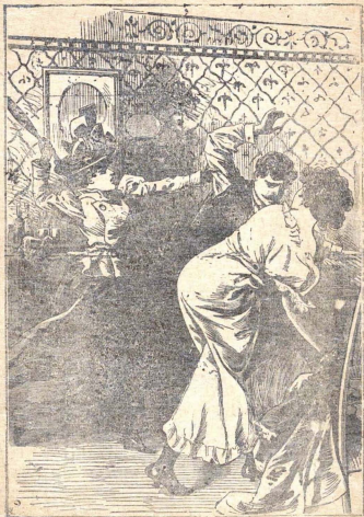
For I punched him with my umbrella— Page 17.