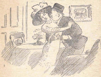
A private refreshment room—Page 14.