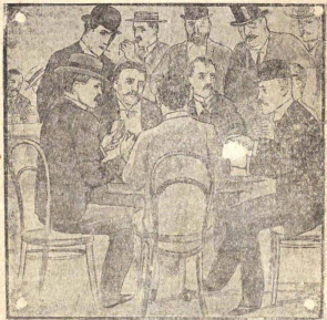
AT THE CLUB.