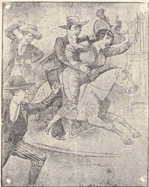
AT BRIGHTON BEACH.