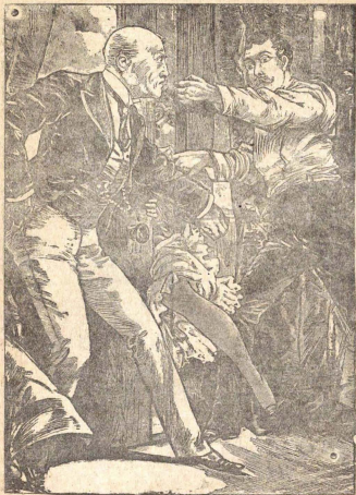
"The young lady was jammed in the doorway"—See page 36.