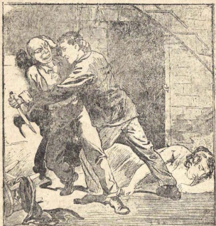
CHINESE LOTTERY SHOPS.