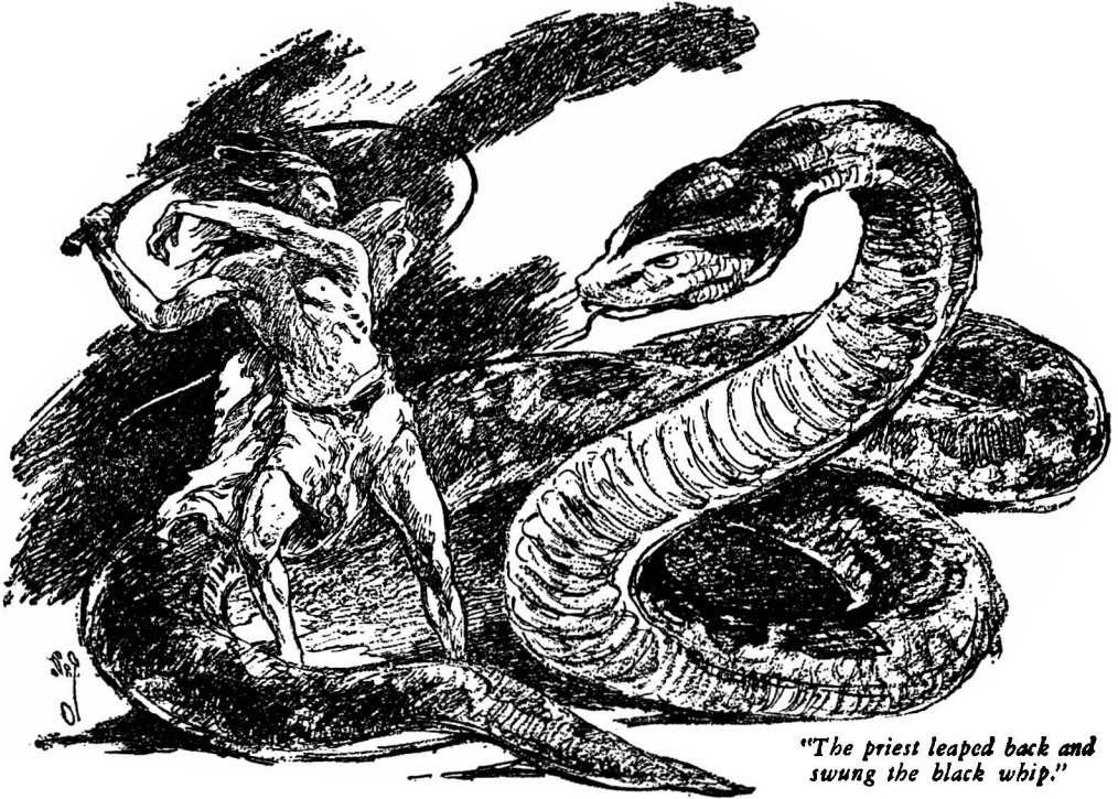
"The priest leaped back and swung the black whip."

inexplicable, mirage-like phenomenon. Price, recovering consciousness on the deserted field of battle, has just been attacked by a member of the cult of the golden snake.