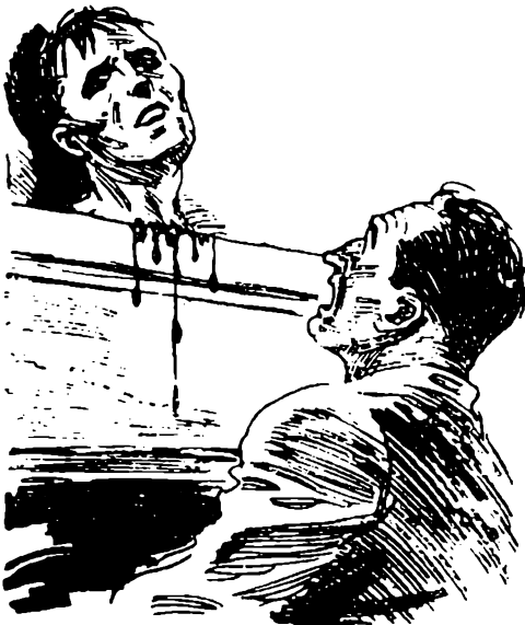
The face was white, cold—dead

Richard was sleeping upstairs, and so was Harrison, the city detective Peter had brought out to hunt down Joel Middleton. Peter's room was on the ground floor, but in another wing. A yell for help might awaken all three, but it would also bring a hail of lead at him, if Joel Middleton were