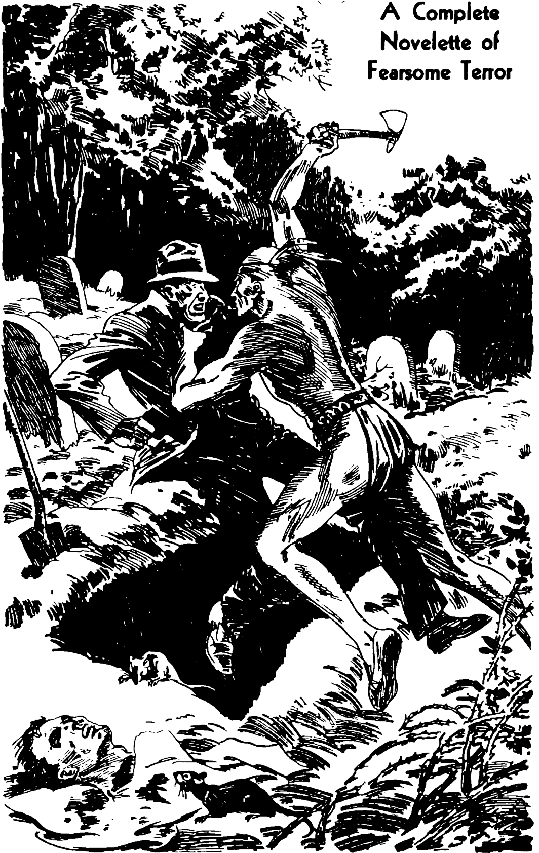
A horrific, half-naked figure lunged at him with a tomahawk