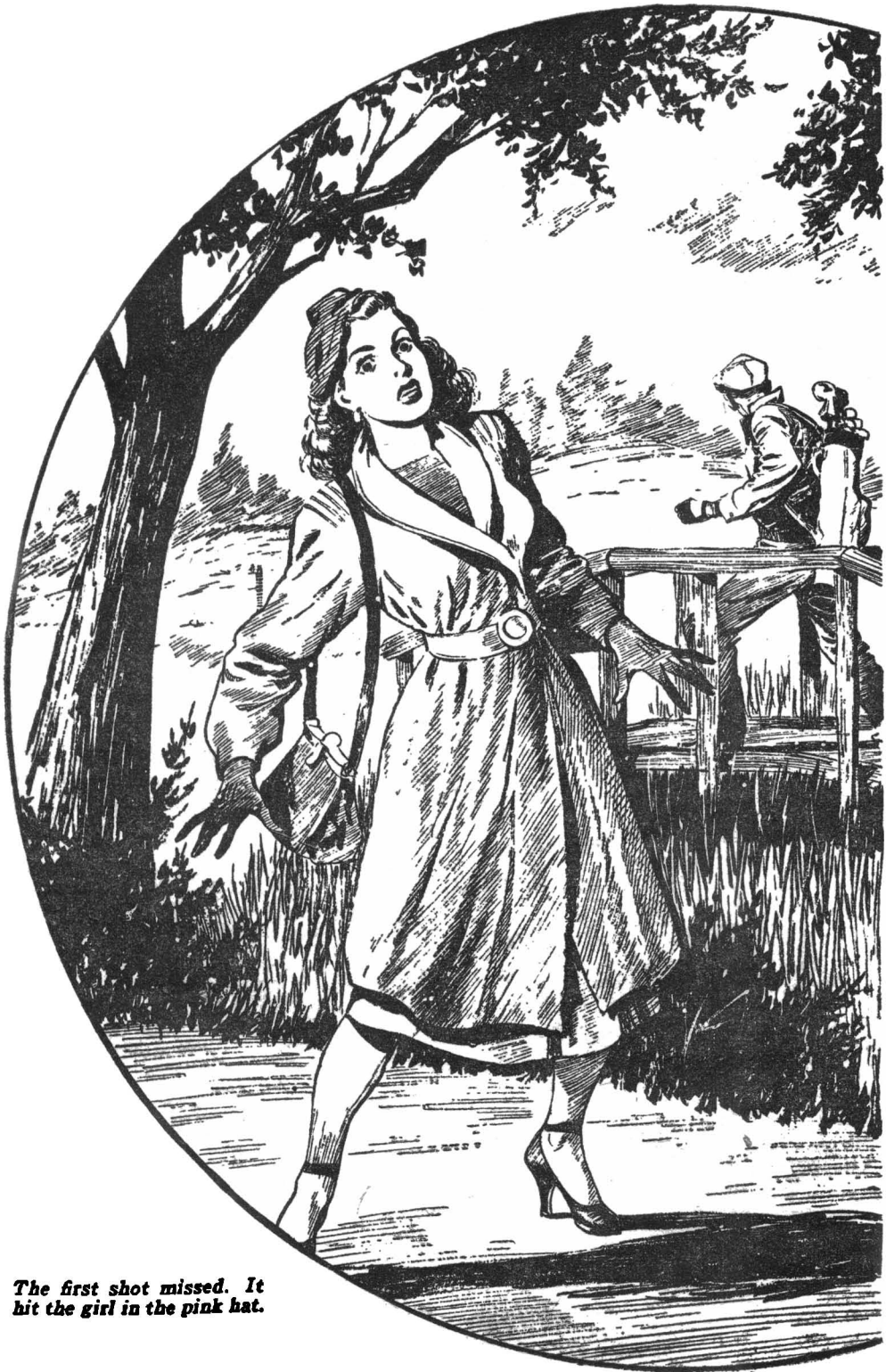
The first shot missed. It hit the girl in the pink hat.