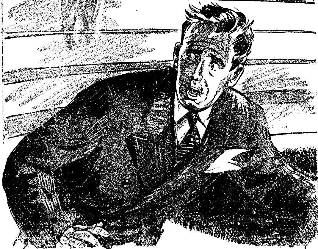
Mocking laughter from invisible lips spurred me on 142'