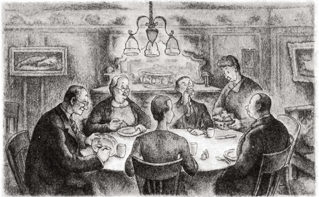
The first night that Walter dined with the family. Grand-ma tried with great eagerness to create a spirit of gaiety.

daughter Jessie and Jessie's husband and their daughter Ruth. Grandma had assisted at the birth of Jessie's three children and at the funerals of two of them. Grandma loved Jessie; but, then, she loved David, too. But Jessie was grandma's daughter; that was a little different. Ruth was grandma's favorite grandchild. She had helped rear Ruth, bathed her and dressed her and petted her. Ruth married when she was nineteen. Grandma was glad Ruth married such a fine man, a young fellow and not very rich, though with a steady position, and exceedingly fond of Ruth. Ruth and her husband moved to Chicago when the firm transferred him there. Then, the next year, Jessie's husband died, and that left Jessie and grandma all alone. Jessie went to Chicago to live with Ruth, went to live with her daughter as grandma had done, quite the right way to do, naturally. But of course Ruth could not have grandma, even if she had wanted to have her. One cannot expect a young man on a small salary to support his wife and his mother and a grandmother besides. Grandma knew that. She was glad Ruth was happy and had a nice little home and that Jessie was happy with her. There was no one else—so grandma had gone to live with David.