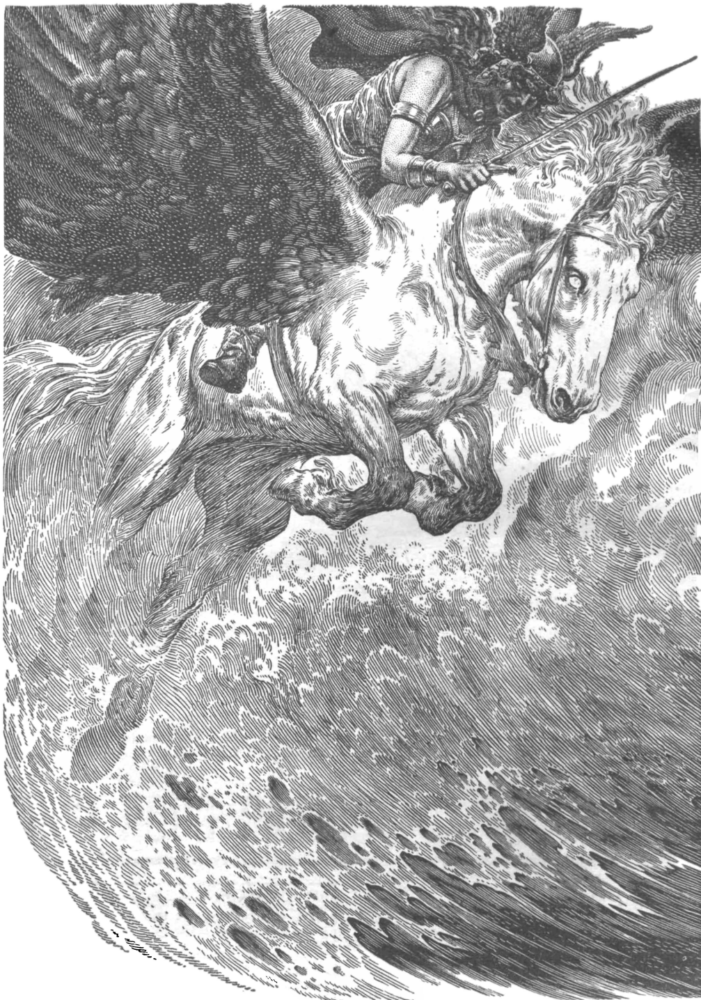
They saw Dark Lagny riding a Valkyr horse in the storm—choosing the dead.