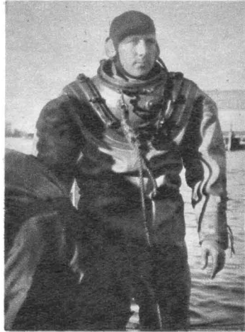
Burford found piracy was more profitable than diving.