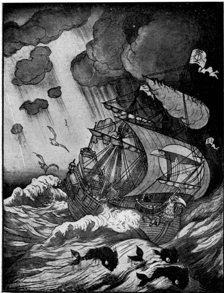
BIRD OF THE RIVER