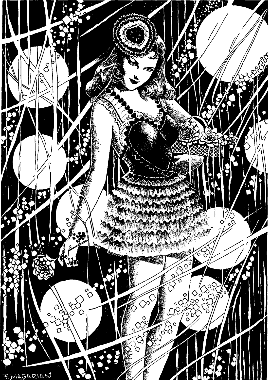
Jane, dressed as a flower girl, was ready for her song