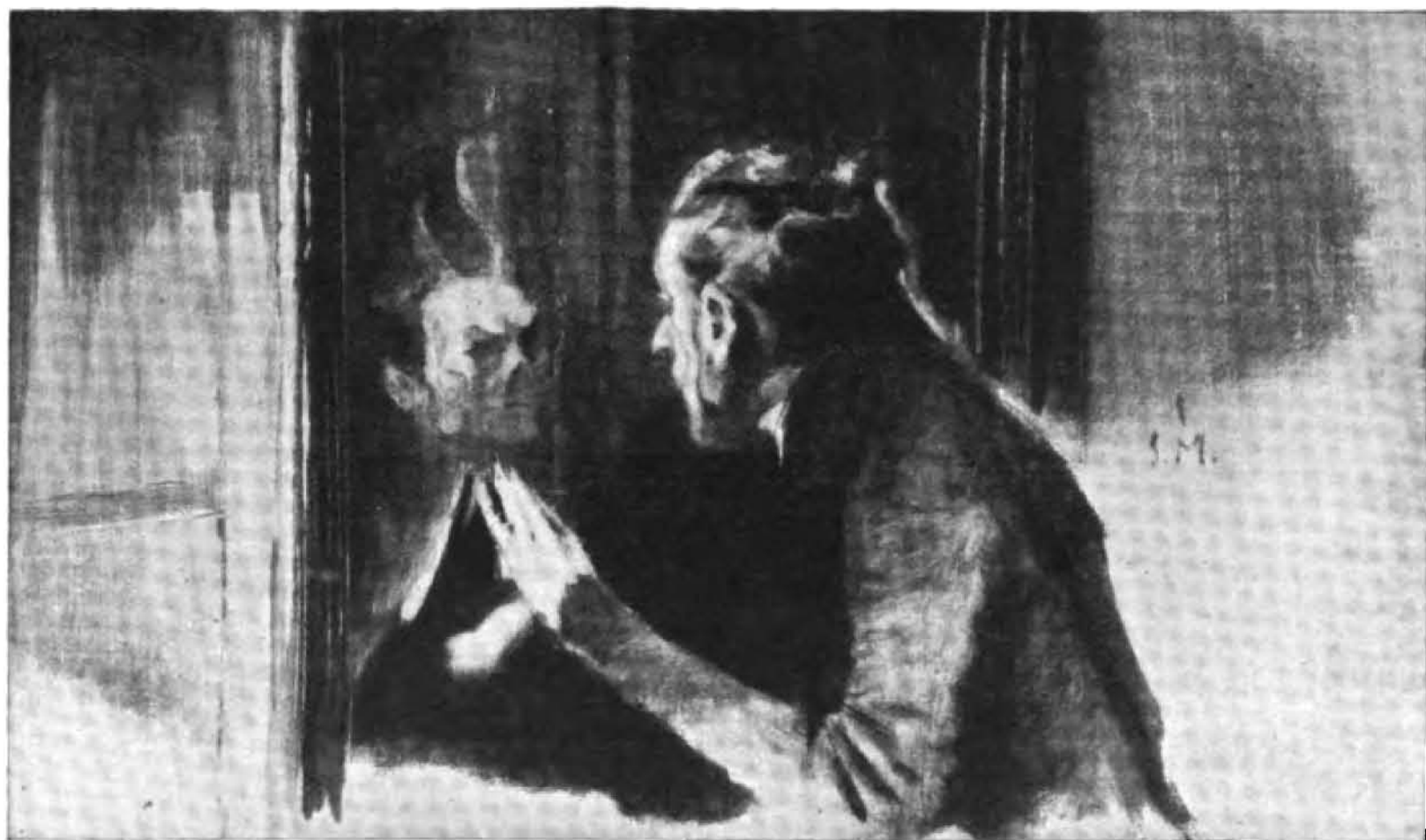
"ON ONE SIDE—THAT MISTY CLOUDLET IN THE MIRROR—THOSE FEARFUL EYES!"

"We are quits. When we played, both the first game, which you won, and the second one, which you lost, we believed , you and I, that we were staking twelve thousand