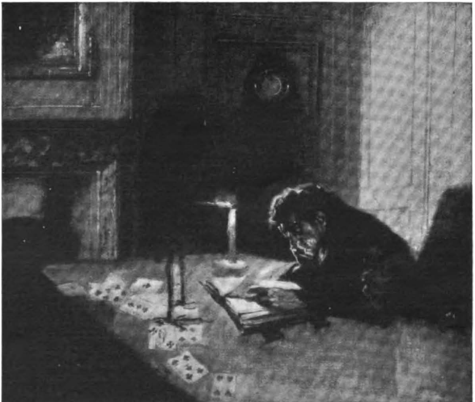
"THE FIRST TWO LINES, PRINTED IN RED, CAUGHT MY EYE—'HE WHO SERIOUSLY WISHES TO SEE THE DEVIL HAS BUT TO SUMMON HIM WITH HIS WHOLE HEART, AND HE WILL COME.'"

"I toyed with the pistol, recalling of a sudden what my past life had been, and wondering for the first time what my death would be like. Suddenly my eye lighted on the titles of a few old books which stood on a shelf hanging above the chest of drawers. I was surprised to see that all of them dealt with sorcerers and matters appertaining to the powers of evil. I took up a book, ' The Sorcerers of the Jura ,' and, with the sceptical smile of the man who has defied Fate, I