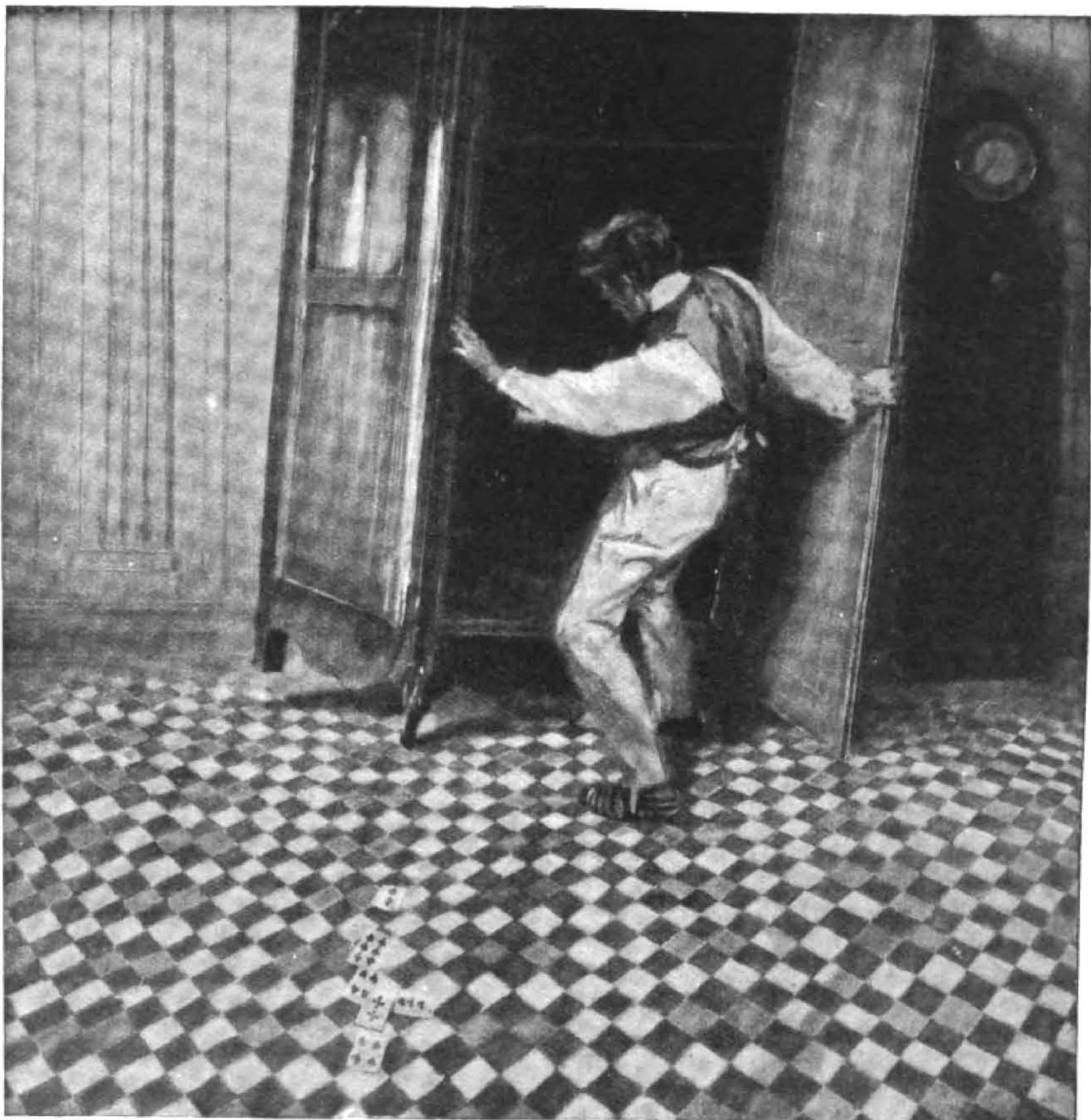
"THERE SHONE WITHIN THE RECESS OF THE WARDROBE, WRITTEN IN LETTERS OF FIRE, THREE WORDS : 'THOU SHALT WIN !'"

lying unconscious at the foot of the wardrobe. Alas! when I had recovered my senses I had forgotten nothing. I was fated never to forget what I had seen. Wherever I go, wherever I wend my steps, be it night, be it day, I read the fiery phrase, 'Thou shalt win!'—on the walls of darkness, on the resplendent orb of the sun, on the earth and in the skies, within myself when I close my eyes, on your faces when I look at you!"