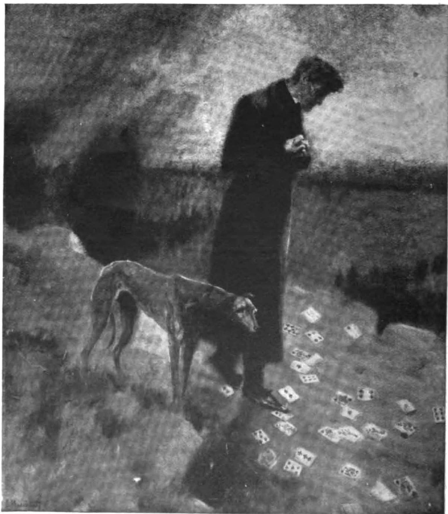
"I FLED LIKE A MADMAN FROM THE ACCURSED HOUSE, AND WANDERED IN THE MOUNTAINS."

"Next day I went to La Chaux-de-Fonds, to call on a notary. All that this adventure with the wardrobe had succeeded