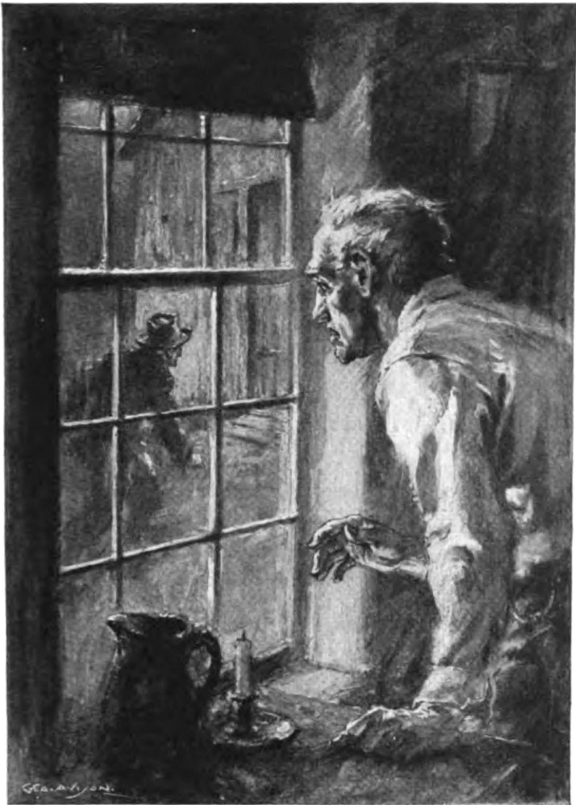
"Crossing this space, he saw the figure of Peter Creed"

I waited a moment, well satisfied with the effect, and then continued.