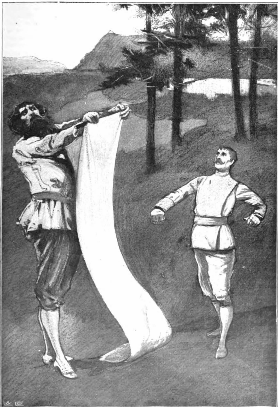
NOTHING LESS THAN A HYPNOTISING MACHINE.