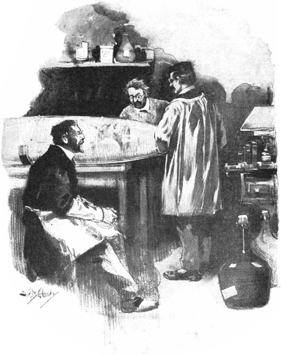
SO ENCLOSED, AS THOUGH IN A HUGE COCOON, BEMIS WAS LEFT IN THE ALCOVE.