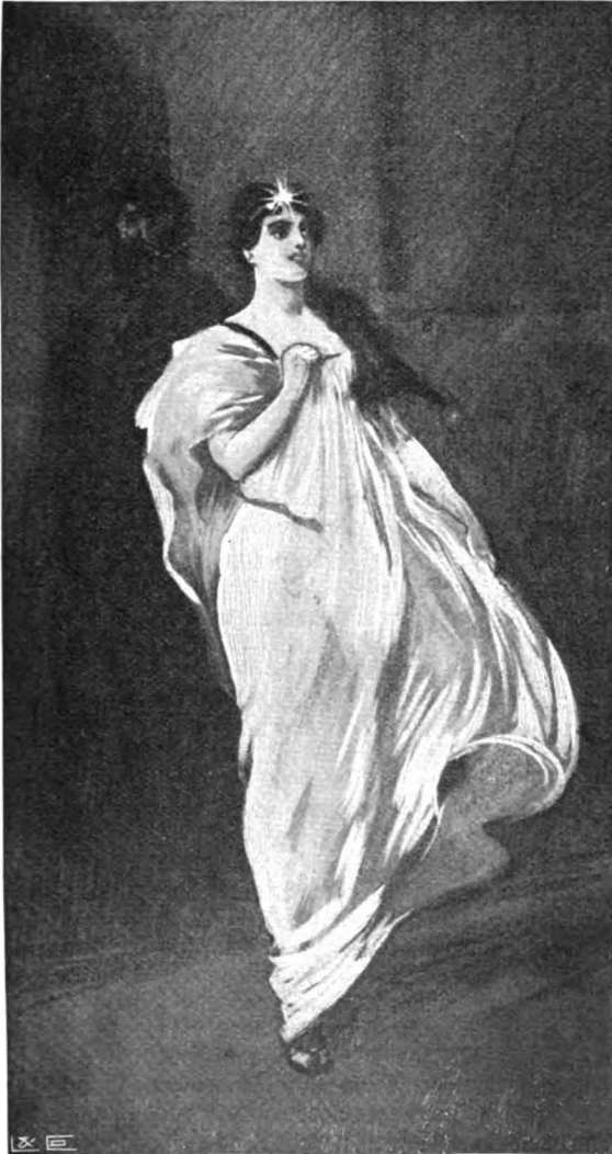
"THIS IS ELECTRA," SAID OUR GUARDIAN.

It had been a surprise to me to find that I no longer loved Eva Pryor. It was not at all a surprise that I should be captivated by Electra. Charming though Eva was in her way, she had perhaps placed herself at a disadvantage by having insisted on keeping her nineteenth century costume. The angular slope and spread of her skirt, her unnatural wasp waist, the swollen sleeves, and the stiff, ungainly bulging of her corsage had a grotesque and