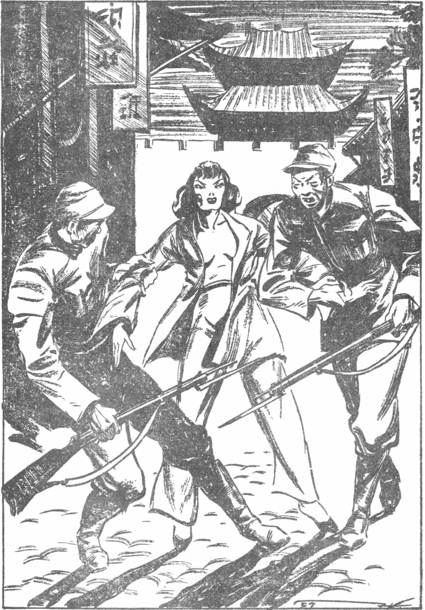
The two sentries came running in like men gone mad.