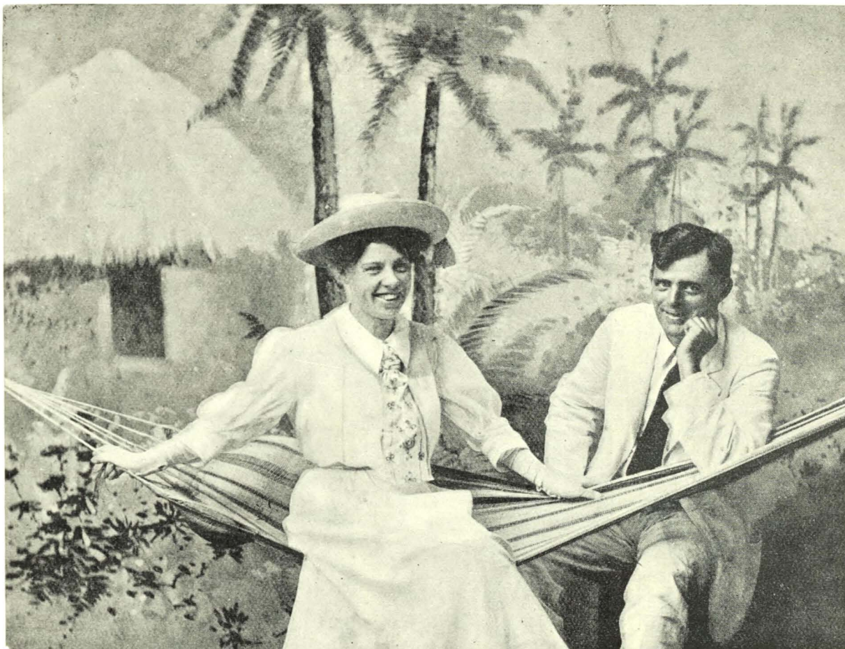
JACK LONDON AND HIS WIFE AT HONOLULU.

she said, 'here's your chance.' And she reminded me of what I'd done at school. Now, at that time, I was working in a jute-factory—doing 11 hours a day of real hard work. When it was over, I