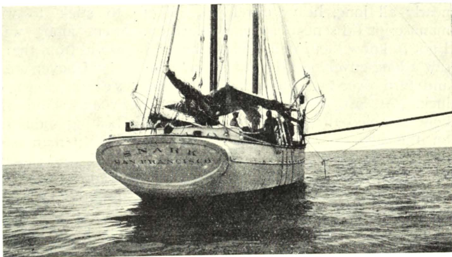
THE SNARK—JACK LONDON'S BOAT.

did score with any of my stories I would be in funds. I'd read an article somewhere about the earnings of magazine writers, and remembered that one of them had got two cents a word. That two cents a word—that's about £4 a thousand—dogged me, and somehow I got the idea that that was the regular price paid for magazine work. In my innocence I didn't realise that the unknown