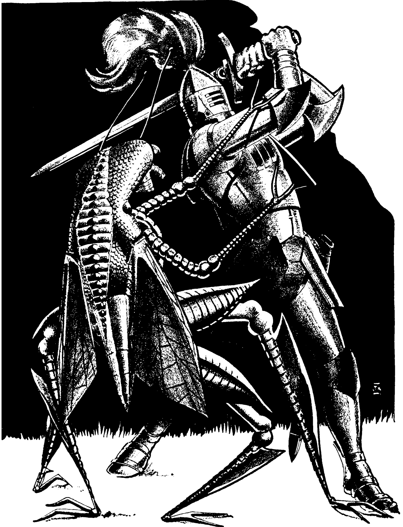
Bravely the warriors of Kalendar fought against the horde of incredible monsters that swarmed out of the darkness