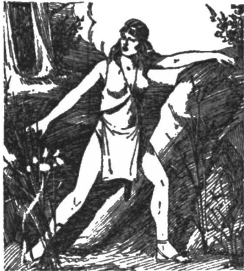
The Priestess Who Rebelled returns next month in another thrilling fantasy laid in the future when women rule the world and few men retain their self respect