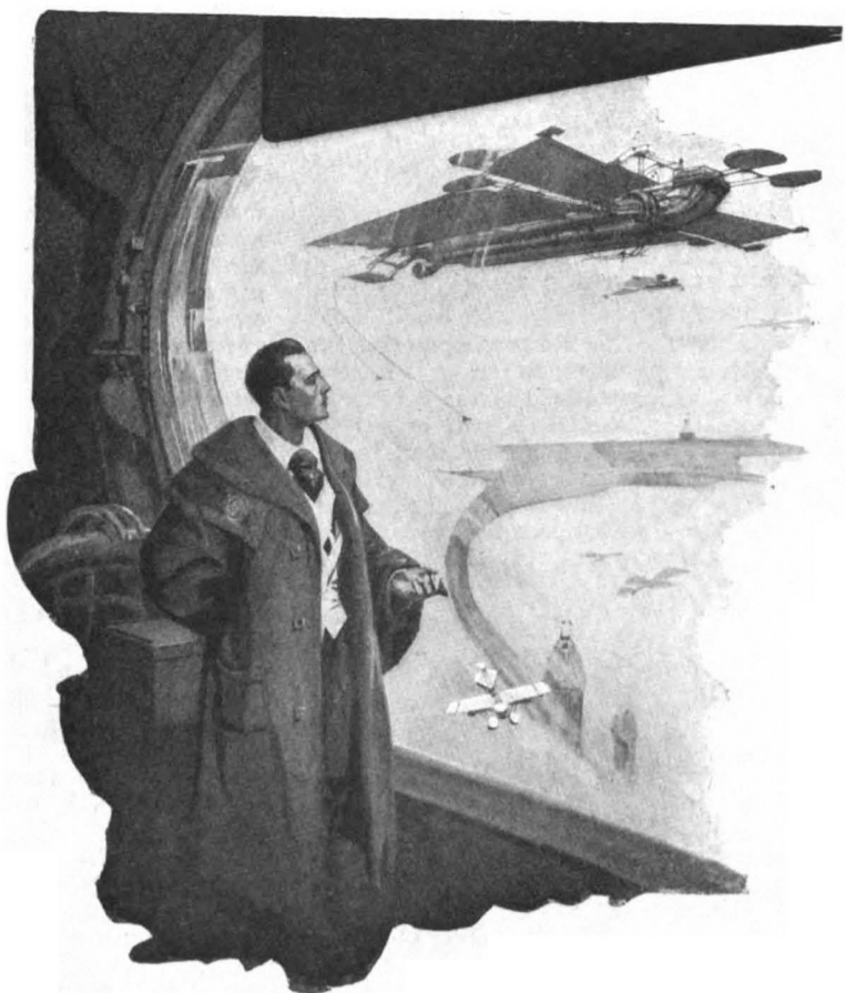
Stanton peered seaward just in time to catch sight of the Twenty-Hour Limited Flyer as it skimmed on its way to London

It increases the blood pressure, remember. And it's shocking bad for the nerves!"