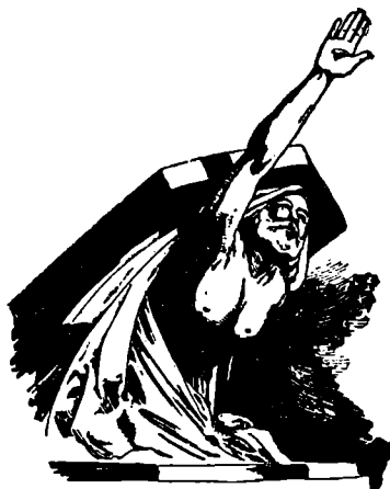
JULES VERNE'S TOMBSTONE AT AMIENS PORTRAYING HIS IMMORTALITY