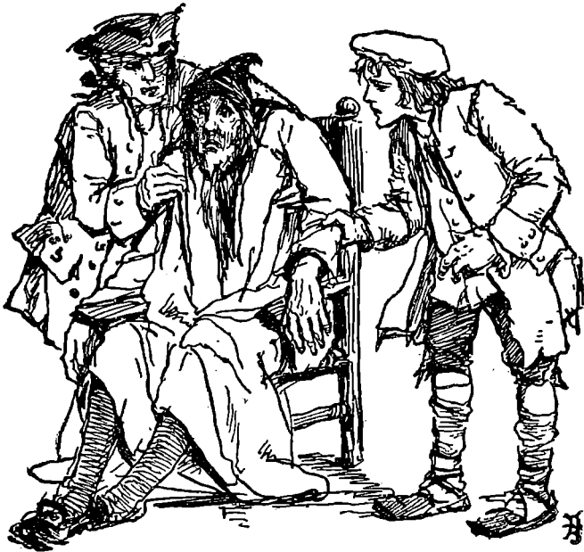
The lawyer set him down in a chair.

There we all looked upon him for awhile, exulting greatly in our success, but yet with a sort of pity for the man's shame.