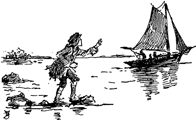
In spite of my supplications, they drew no nearer in.

"Yes, yes—yes, yes," says he, and then he looked at the other men, as much as to say, "I told you I spoke English," and began again as hard as ever in the Gaelic.