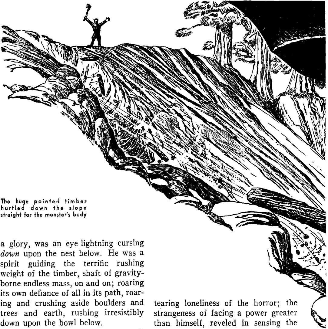
The huge pointed timber hurtled down the slope straight for the monster's body

a glory, was an eye-lightning cursing down upon the nest below. He was a spirit guiding the terrific rushing weight of the timber, shaft of gravity-borne endless mass, on and on; roaring its own defiance of all in its path, roaring and crushing aside boulders and trees and earth, rushing irresistibly down upon the bowl below.