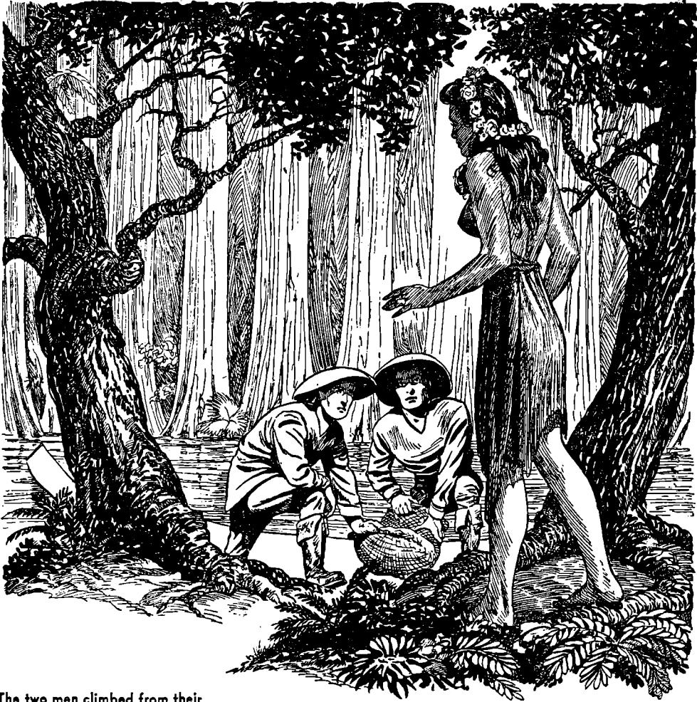
The two men climbed from their canoe and onto the bank, their eyes on the girl before them

ANOTHER and another of the peculiar pop-eyed little men shot to the surface, clambered ashore. Their eyes were tremendous, and they darted about with the motion called "Venusian eyes," Hal noted. He tried to see everything himself. Their ears were not at all human, being very large, pointed on top, with wide flaring lobes. They were all three bald as eggs.