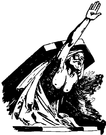
JULES VERNE'S TOMBSTONE AT AMIENS PORTRAYING HIS IMMORTALITY