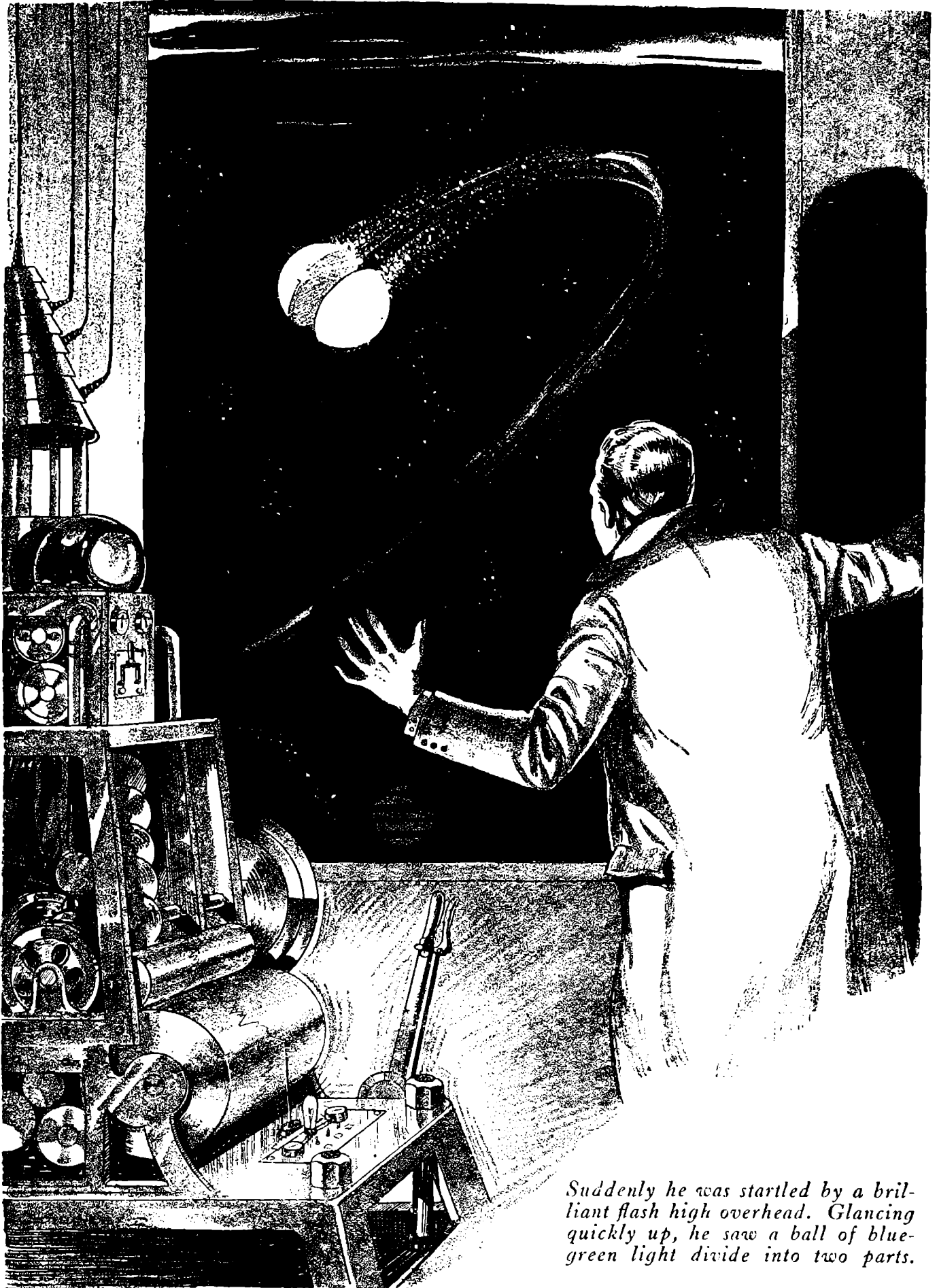
Suddenly he was startled by a brilliant flash high overhead. Glancing quickly up, he saw a ball of blue-green light divide into two parts.