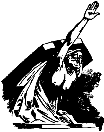
JULES VERNE'S TOMBSTONE AT AMIENS PORTRAYING HIS IMMORTALITY