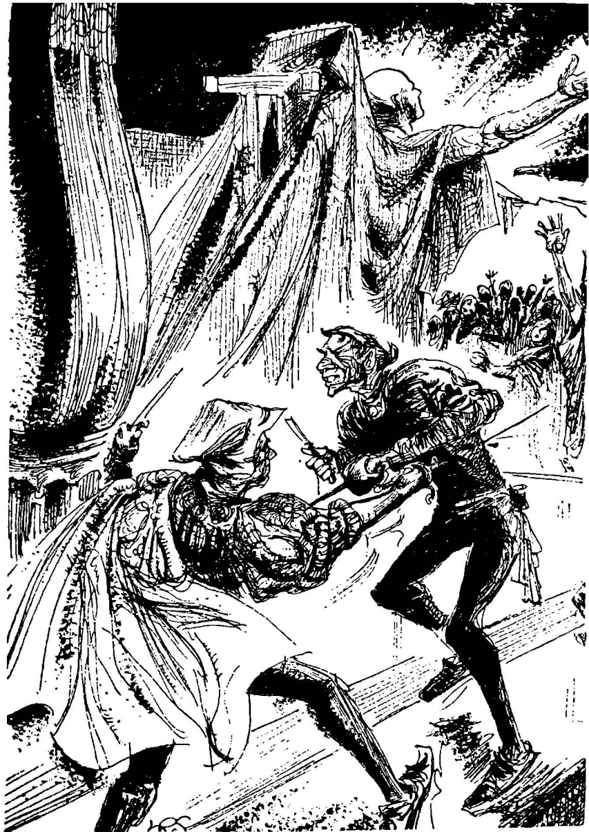
To the god-crazed crowd there was no was happening—the divine Issek