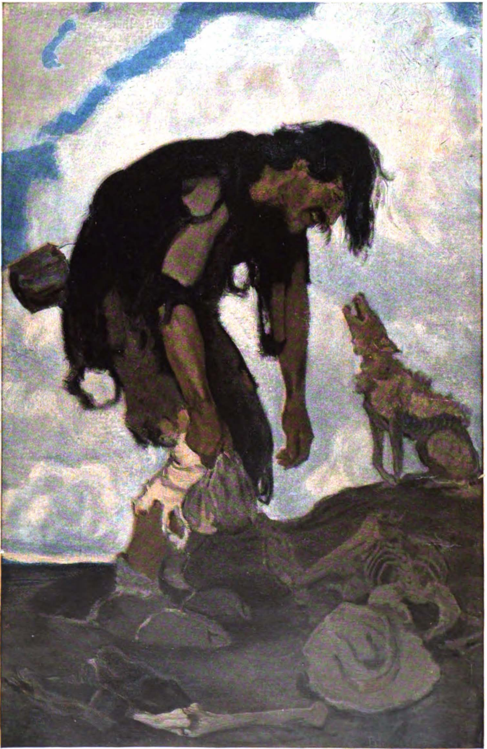
“HIS MIRTH WAS HOARSE AND GHASTLY, LIKE A RAVEN’S CROAK, AND THE SICK WOLF JOINED HIM, HOWLING LUGUBRIOUSLY”