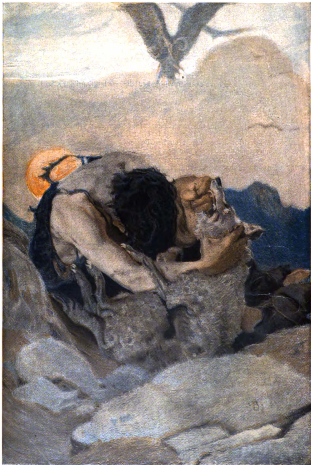
"SLOWLY, WHILE THE WOLF STRUGGLED FEEBLY AND THE HAND CLUTCHED FEEBLY THE OTHER HAND CREEPT ACROSS TO A GRIP"