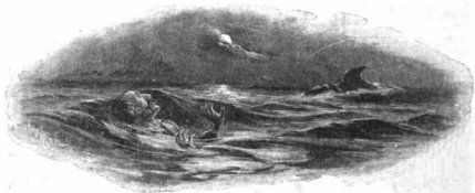
"UPRIGHT IN THE WATER, FIFTY YARDS AWAY, WAS A BLACK TRIANGULAR OBJECT—A FIN."

and stared after the light—his soul in his eyes. As he watched it, it grew gradually but steadily smaller. Then the man knew that his fate was certain. Despair succeeded hope. Gratitude gave place to curses. Beating the water with his arms, he raved impotently. Foul oaths burst from him, as broken as his prayers—and as unheeded.