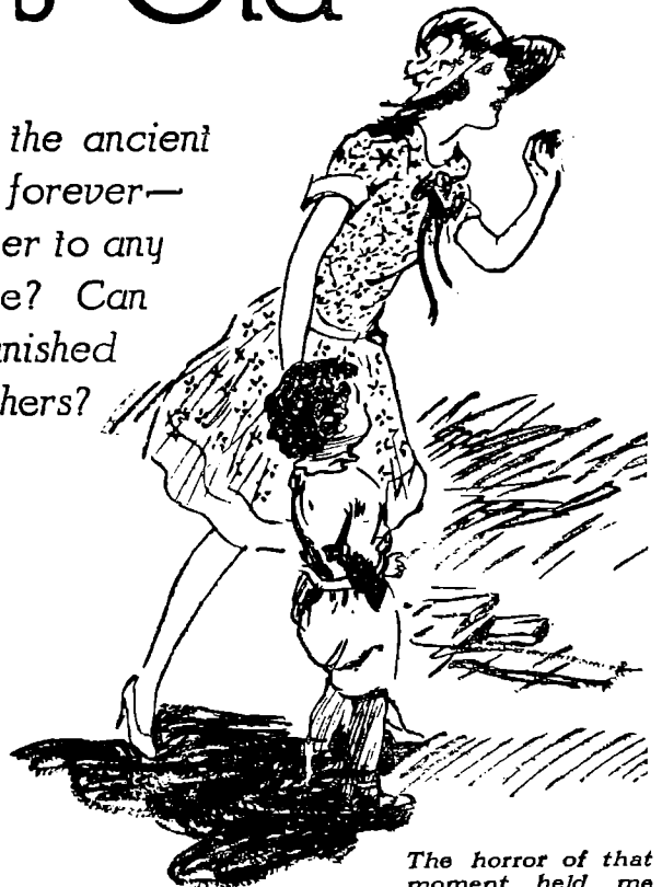
The horror of that moment held me speechless

I WHO loved Life, yet laughed at it, swore that it should be my slave. I would do what I wished always—would never bend, lest I should break.