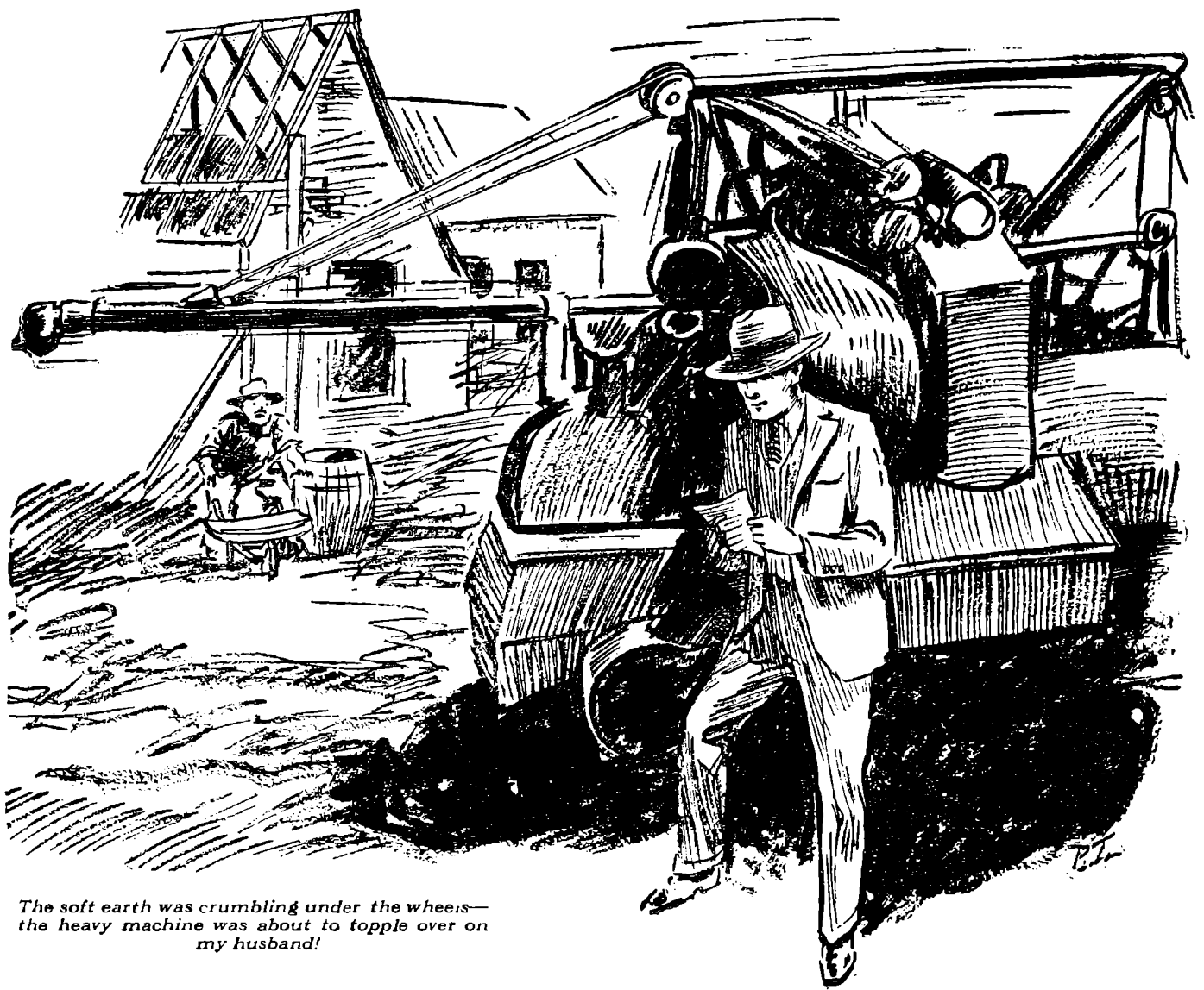
The soft earth was crumbling under the wheels— the heavy machine was about to topple over on my husband!

"Don't you know what happened there?" she asked, in surprise. "It has never been used since your grandmother hung herself. Folks around here say that it is haunted—that there are strange lights there."