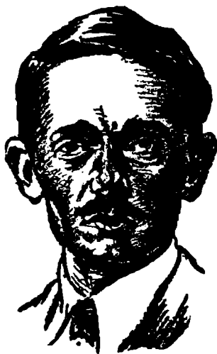
Clark Ashton Smith

I try to keep my eyes on the control-board—on the astronomic charts—on the log I am writing—on the stars toward which I am travelling. But a frightful and irresistible magnetism makes me turn at intervals, and mechanically, helplessly, to the rearward ports. There are no words for what I feel and think—and words are as lost things along with the worlds I have left so far behind. I sink in a chaos of vertiginous horror, beyond all possibility of return.