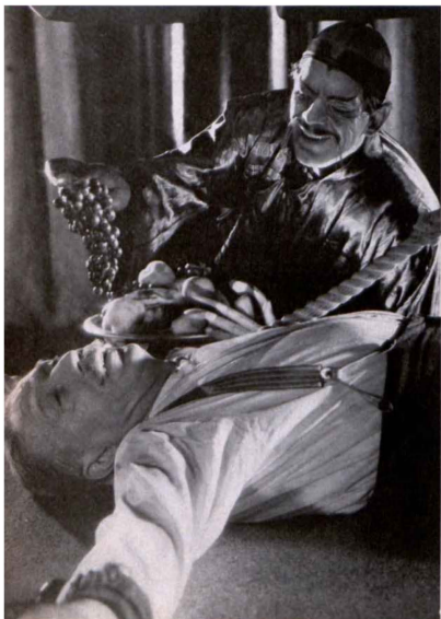
As the Oriental despot in The Mask of Fu Manchu , Karloff devised fiendish tortures for his enemies.