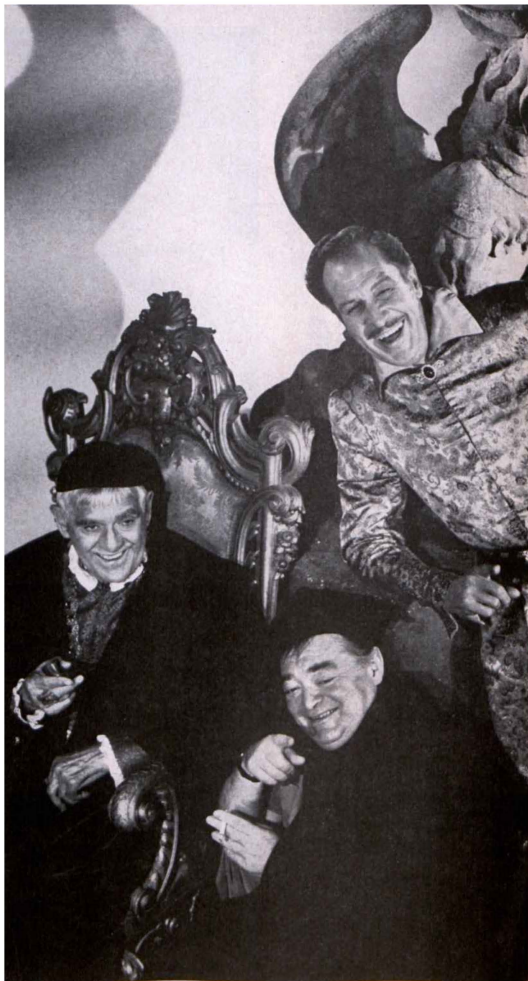
Hamming it up on the set of The Raven , his latest movie, Karloff quips with Peter Lorre and Vincent Price. He broke them up with weird facial expressions.