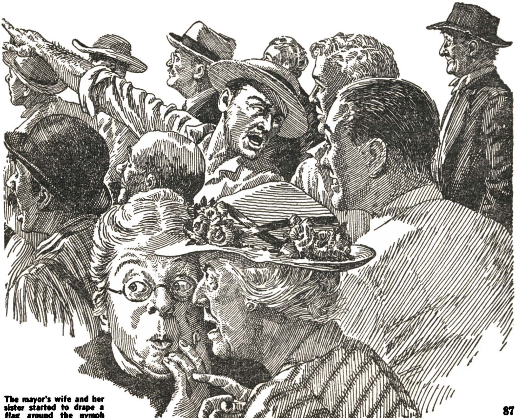
The mayor's wife and her sister started to drape a flag around the nymph

The dust waited expectantly. But too much of it had got down his throat. It was hot too and such moisture as he possessed preferred to come out less violently as perspiration. Nevertheless he sucked around his