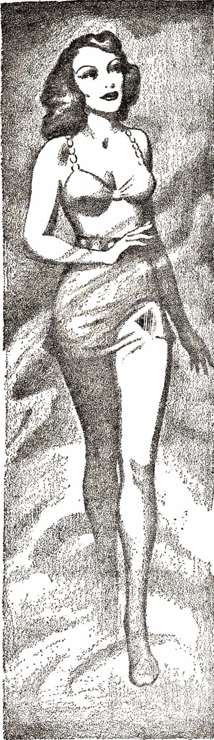
Illustration by KIEMLE

B ARRY WILLIAMS watched the last sunshine lance across the red sands of the Martian Desert. The sun dropped abruptly behind the flat horizon. With the black curtain of night, the usual sharp chill came to the thin Martian atmosphere.