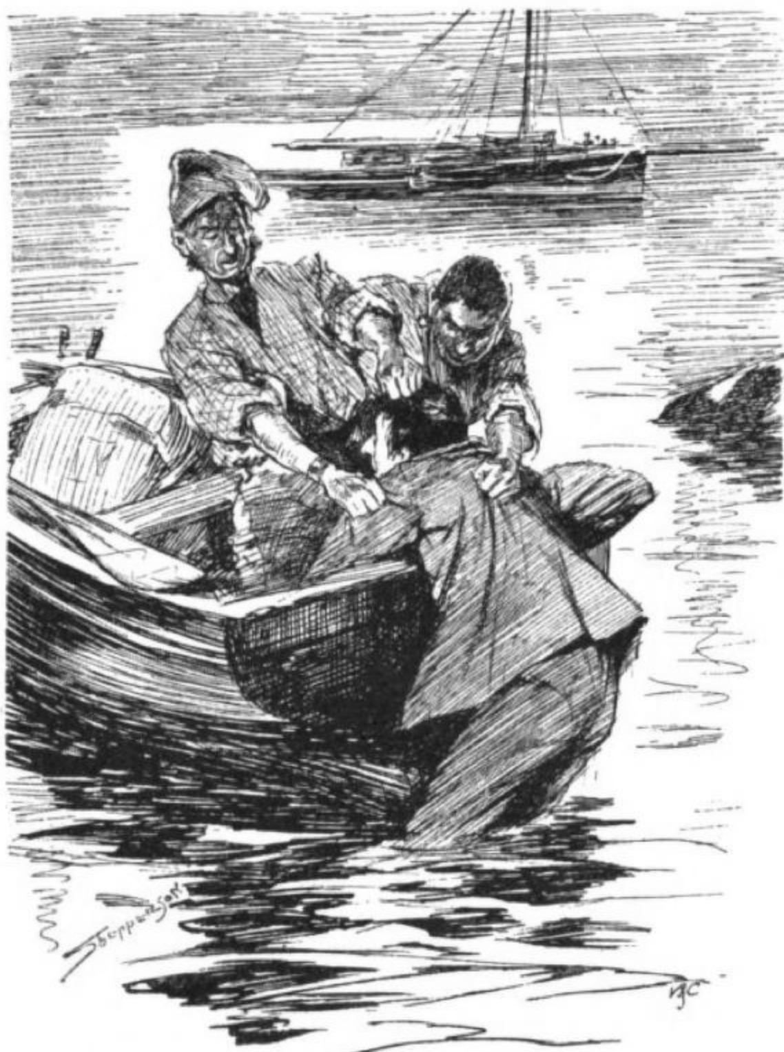
"THEY PULLED HIM ABOARD BY THE SHOULDERS AND HAIR."

where they put him, night and day, and in the night-time there were rats. The Orientals emptied his pockets and took his watch—but Mr. Bingham, being appealed to, took that himself. And five or six times the five Lascars—if they were Lascars—and the Chinaman and the negro who constituted the crew, fished him out and took him aft to Bingham and his friend to play cribbage and euchre and three-handed whist, and to listen to their stories and boastings in an interested manner.