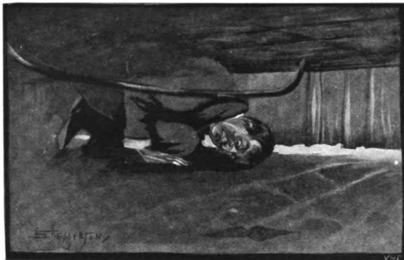
"THE POSITION WAS IN MANY RESPECTS AN ILL-ADVISED ONE."