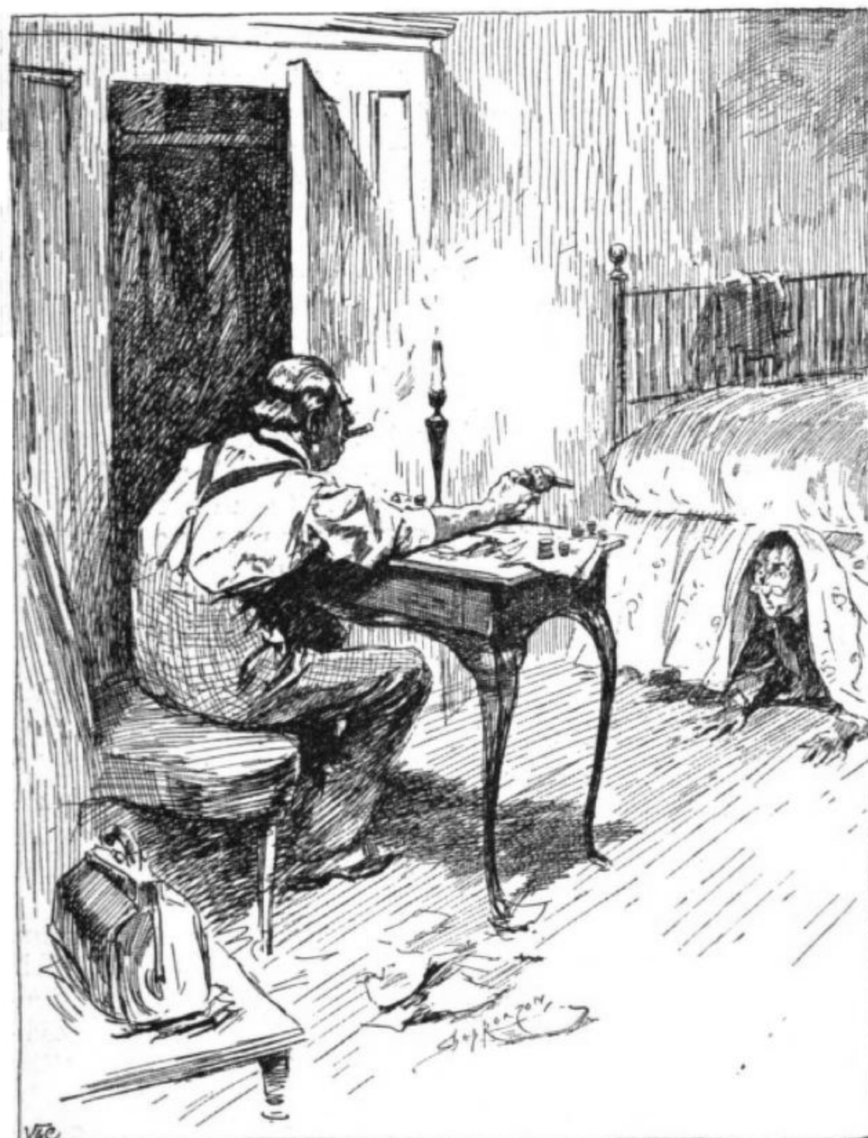
"COME OUT OF THAT, YOU SCOUNDREL!"

quiet concentration. "Come out. This side, and now. None of your hanky-panky—come right out, now."