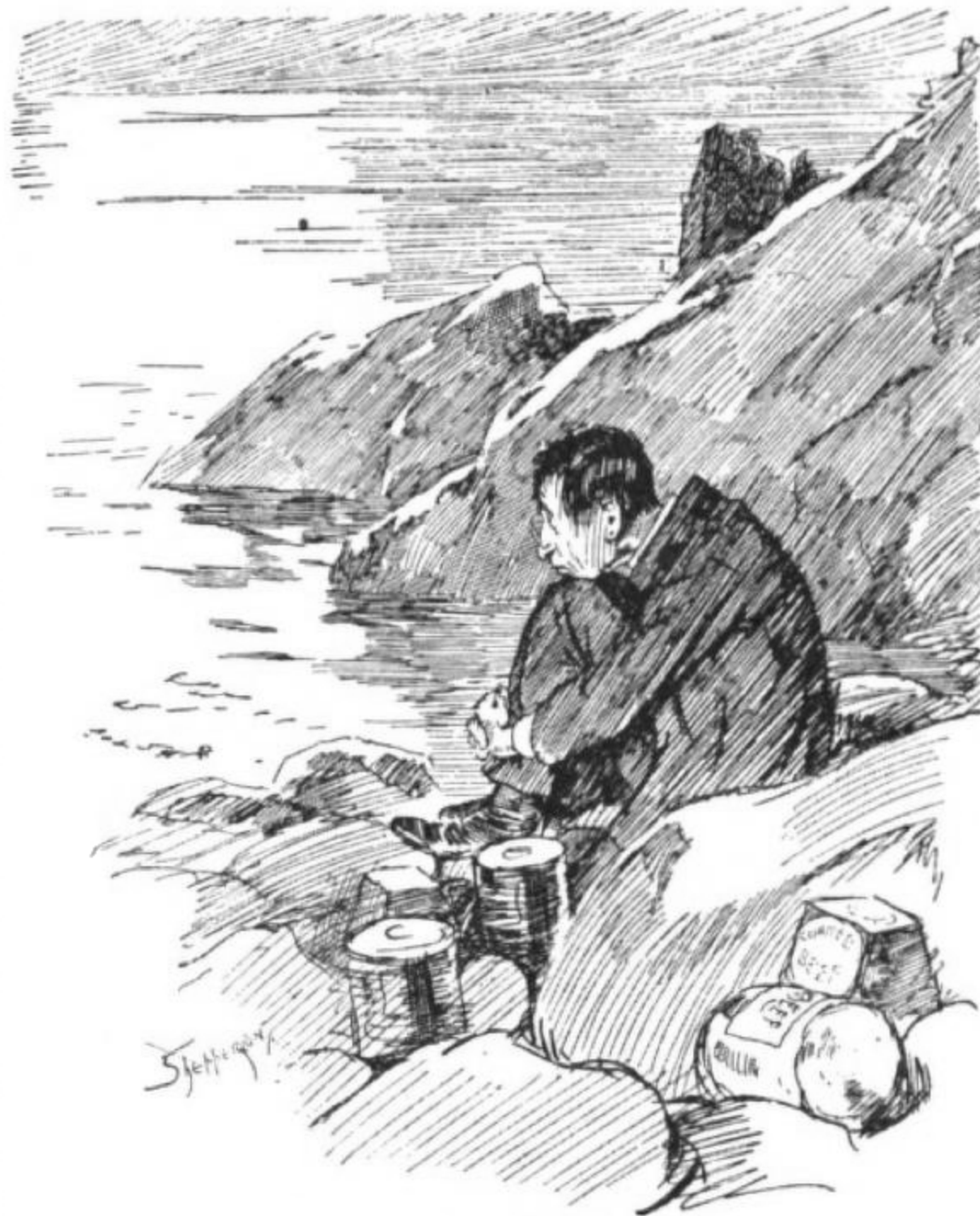
"SITTING BESIDE HIS CANS OF FOOD."

He stopped hopelessly. The man's tone tickled me. He seemed an odd character. "I am," he said, "one of the most unfortunate beings alive."