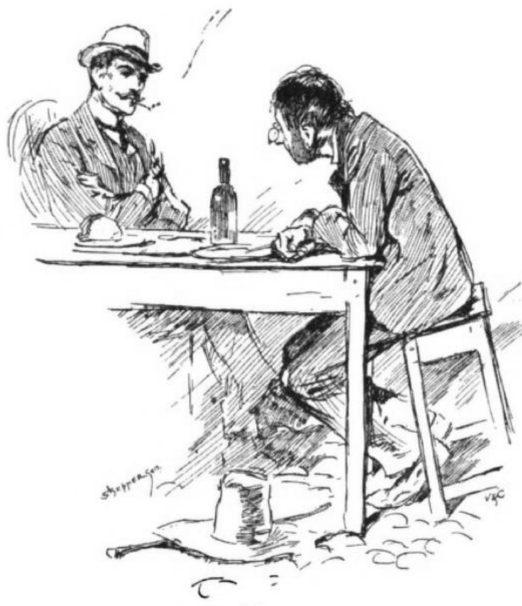
"AND THERE I GOT HIS STORY."

So the remarkable story of Mr. Ledbetter's Vacation ends. That breach with his aunt was not of long duration. The old lady had fully forgiven him before she died.