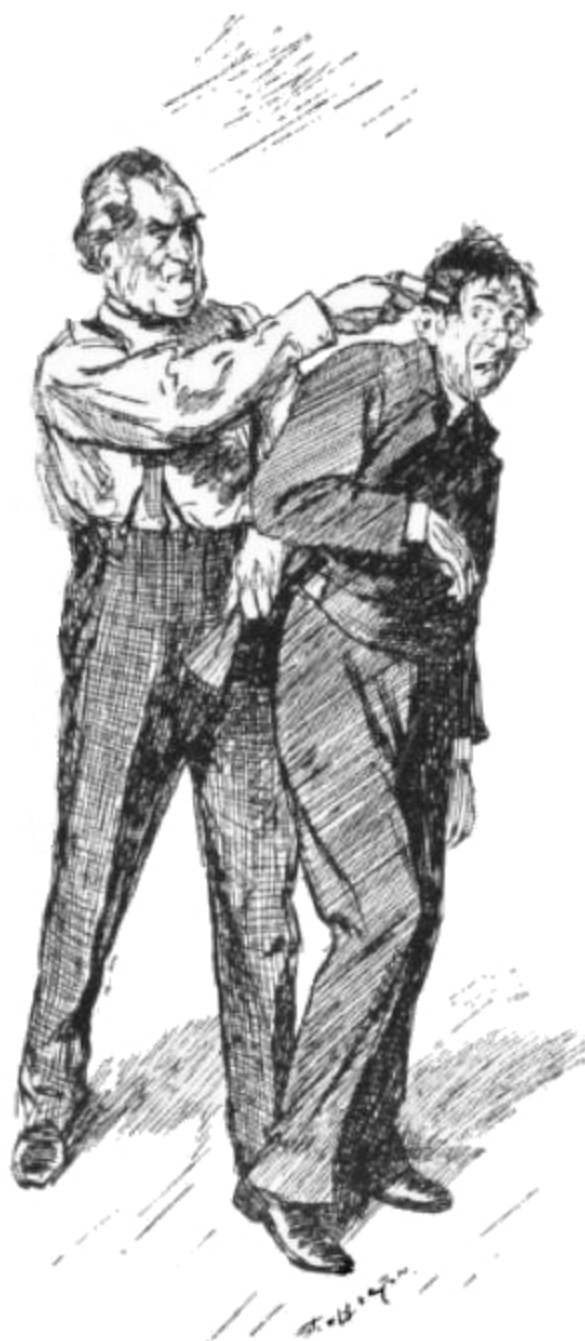
"HE POINTED HIS PISTOL AT MR. LEDBETTER'S HEAD."

Mr. Ledbetter strapped the trunk and bag, and returned the stout man the keys. It was then ten minutes to twelve, and until the stroke of midnight the stout man made him