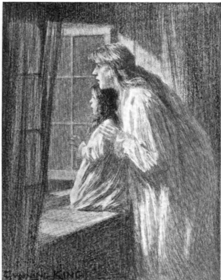
“Who be they, mother?” asked the child in an awed whisper.”

through her mind, without seeming to her at the time at all ridiculous, that her two beloved ones out there must be cold on the wet grass. She was too agitated just then to question herself as to the meaning of this strange portent, and she could only watch helplessly and silently, save for her heart, which throbbed so violently that it seemed to her in the stillness of the night the two must hear it.