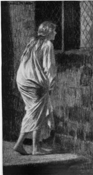
"She climbed on the tomb again, but the two were no longer there."

"Nonsense!" replied Mrs. Dishman. "Look zee, they was in love with one another in secret, and becoss they had to keep it secret it killed 'em both. They never done