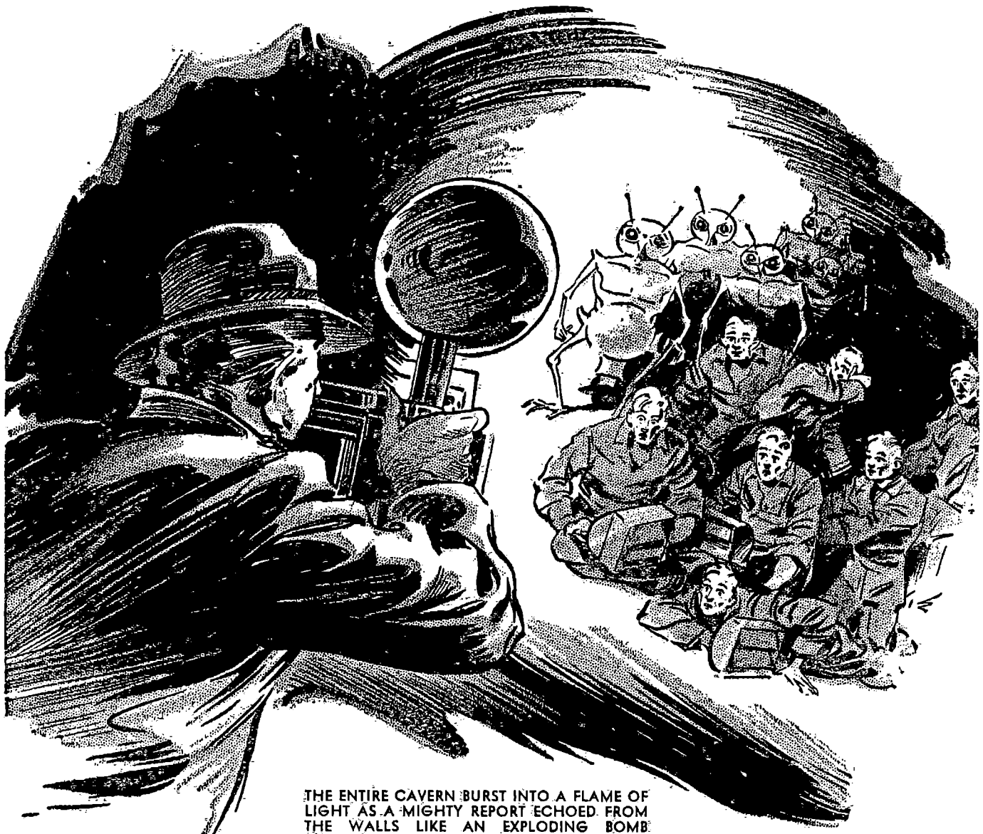
THE ENTIRE CAVERN BURST INTO A FLAME OF LIGHT AS A MIGHTY REPORT ECHOED FROM THE WALLS LIKE AN EXPLODING BOMB.

Suddenly the entire cavern burst into a flame of light as a mighty report echoed and re-echoed back among the tiers. The firemen sprawled and groveled in abject terror, certain that this was the end. The