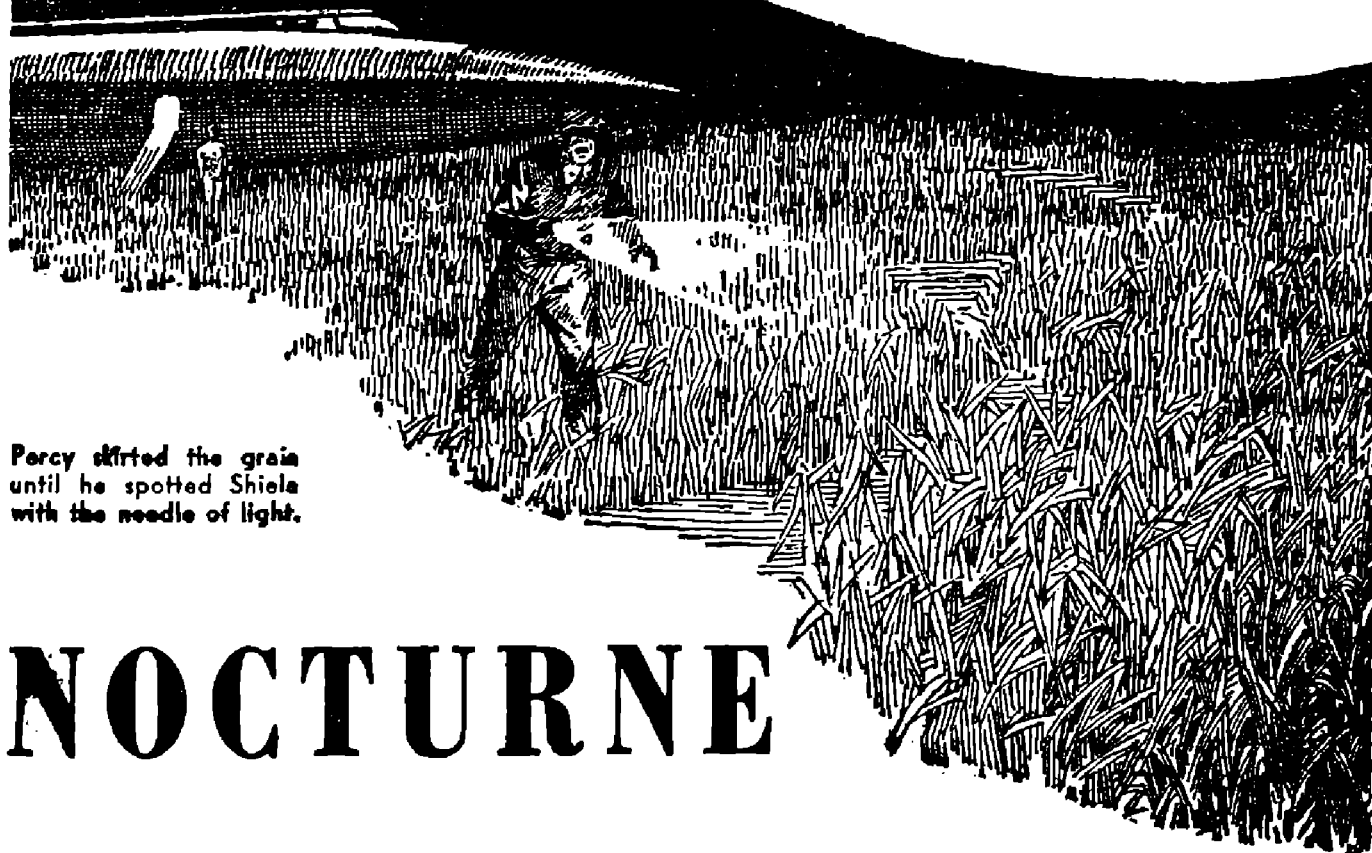
Percy skirted the grain until he spotted Shiela with the needle of light.

It was strange, weirdly beautiful celestial music that the astronomer conducted on the faraway planet—but much stranger still was the orchestra that he led!