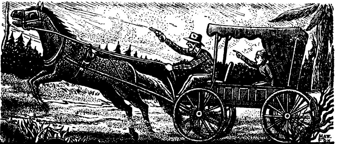
Heading by Matt Fox

Indians knew all about them and they tried to keep white folks from noticing too much or settling too close to the hills. Them ones didn't cause much trouble, but they might if they was crowded. So the Indians