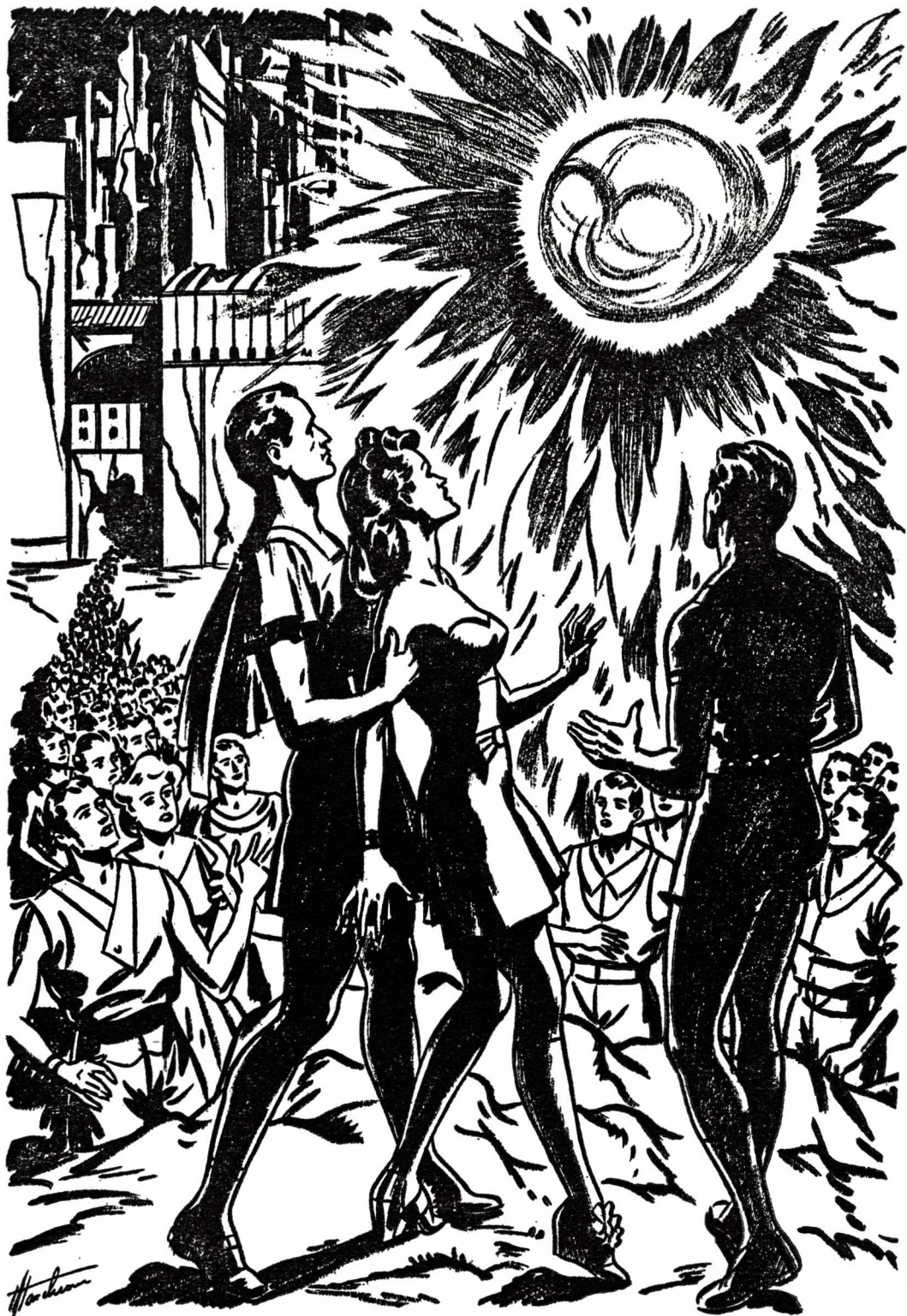
Something wraith-like came curling out of the depths of space (CHAP. XIV)