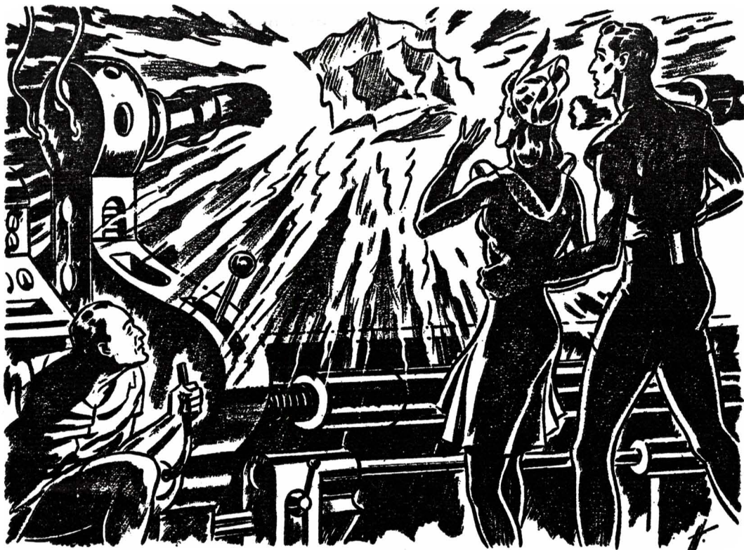
Vera screamed as the overload blew out the circuit (CHAP. I)