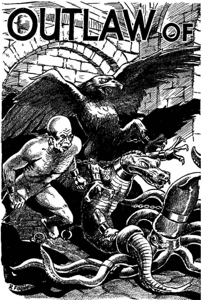
Three of the Martians became monsters under the evolution ray