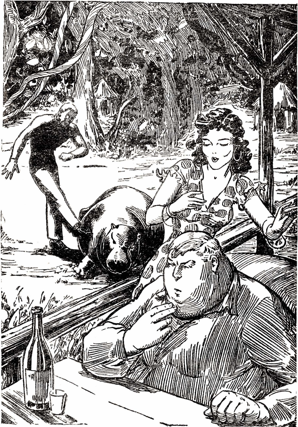
Under the tick, the hippo grunted and rolled on its side, while Buston chewed his bitter out of contemplation.