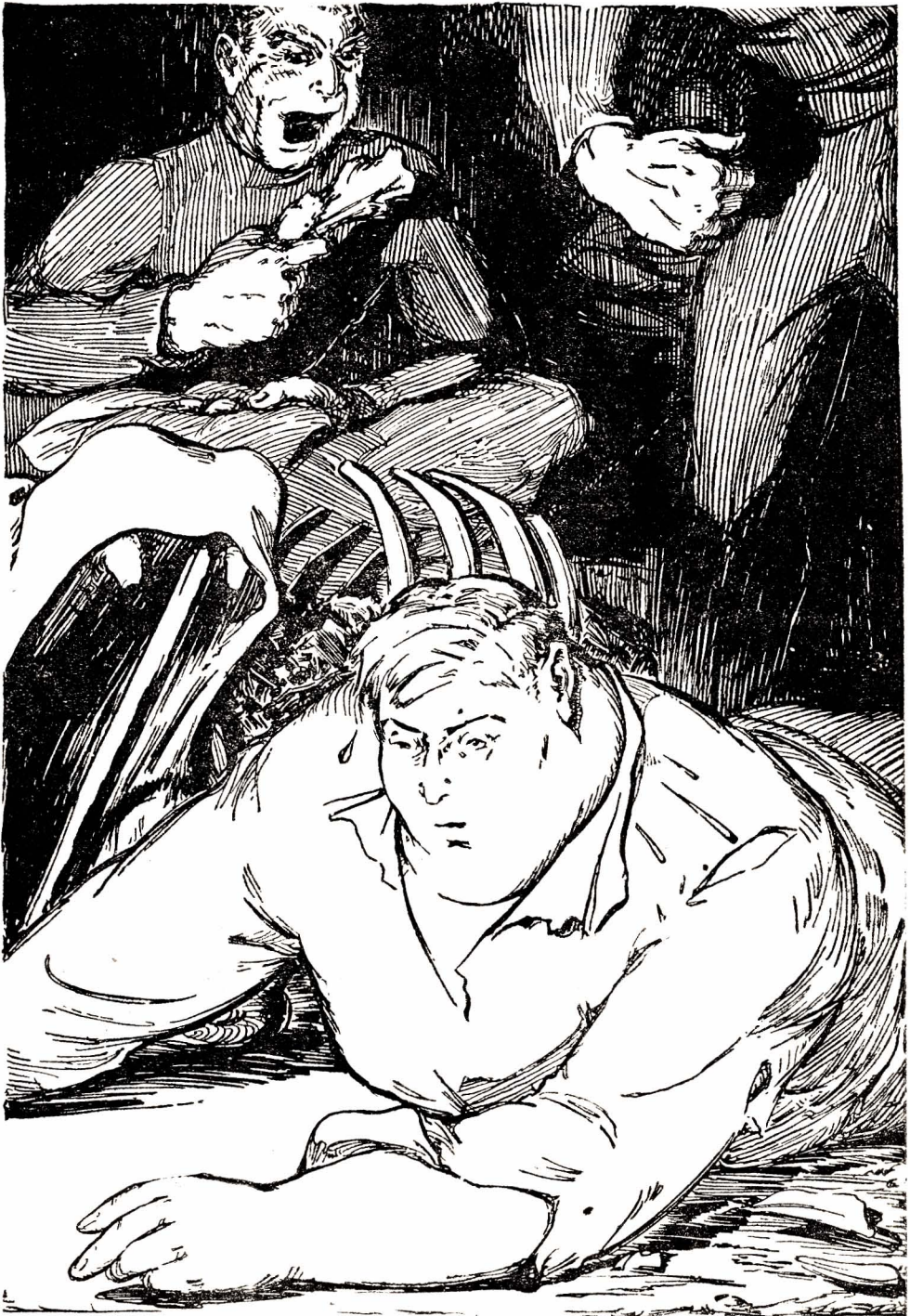
Too sluggish to continue the unequal struggle, Button subsided by the murdered Churchill.