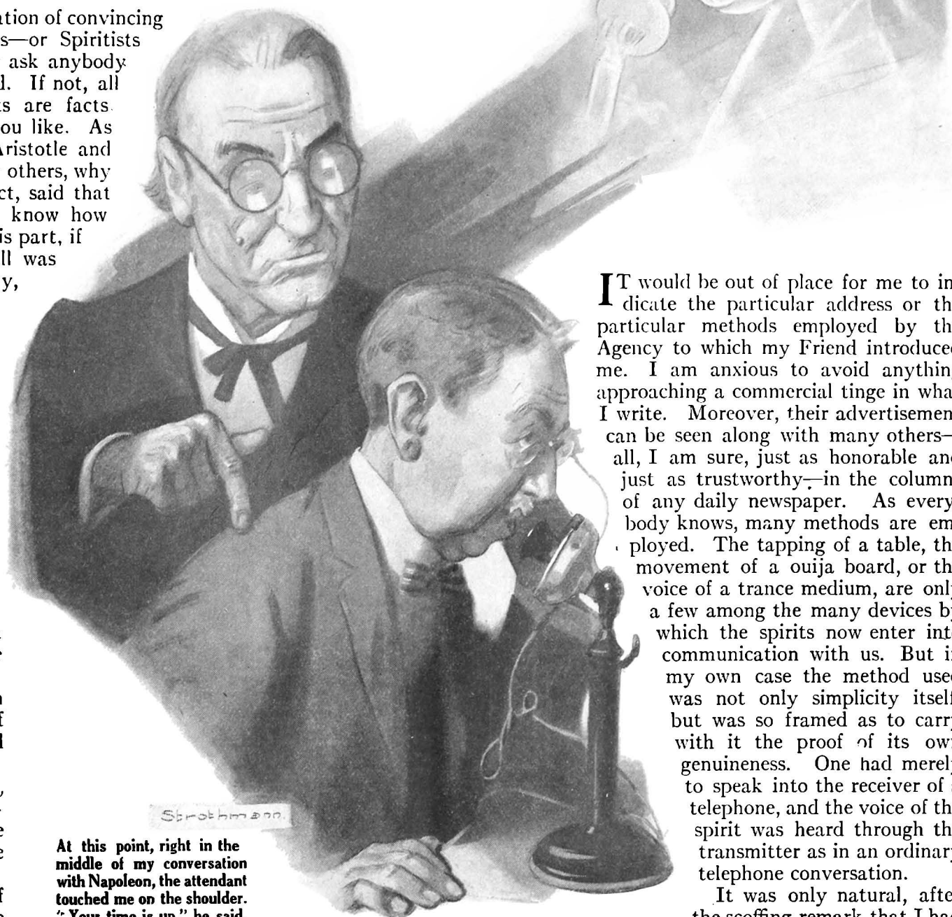
At this point, right in the middle of my conversation with Napoleon, the attendant touched me on the shoulder. "Your time is up," he said.

There was silence between us for a time, and then my Friend said: "Have you ever given it a trial?"