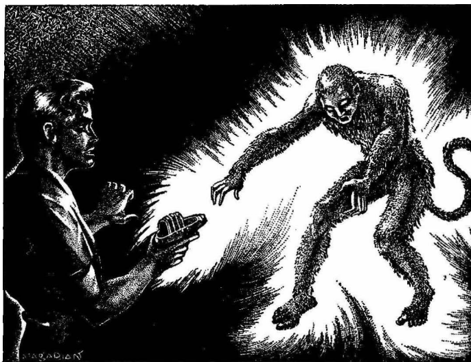
Dawson brought his gun up, and the Tolzan's body glowed silently and he died

Until then Dawson had not realized that the tremendous power Karmak wielded came from another source, that Karmak was in reality only a remote-control relay station. The fellow was fighting desperately to maintain the upper hand, but it was patently a losing fight.