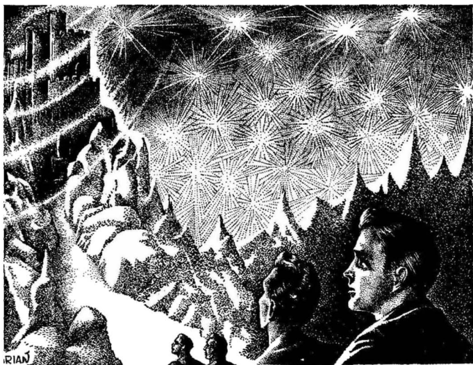
The castle loomed out of the mists before us

"Getting into that place is going to take some doing," Dawson told himself.