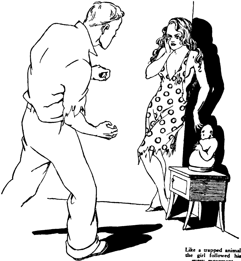
Like a trapped animal the girl followed his every movement.

is by no means easy. For the most part they are women who come to the East in entertaining troupes. It will be your duty to meet them at the American Hotel or in the cafes and lure them here. After that I will do the rest."