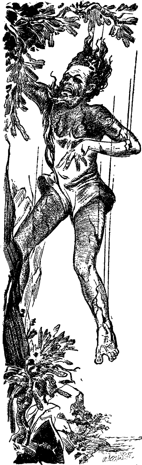
His body crashed, cutting off the wild madness of his death-cry

The Mystic Snake Gave Cruel Claudius Youth—But Wild Debauches Deafened Him To His Enemies' Hisses