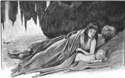
"His little stomach fitted better into the lump of boulder."