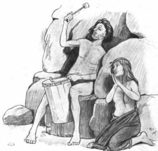
"Mug speedily abandoned his honest calling in order to devote himself to music."

it, and she could feel them plainly through the layers of skins.