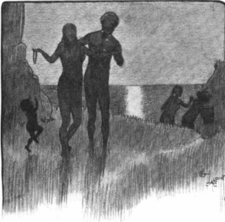
"Thus the fair Zug obtained her heart's desire, and peace was restored to the cave of Ug."

Thus the fair Zug obtained her heart's desire, and peace was restored to the cave of Ug.