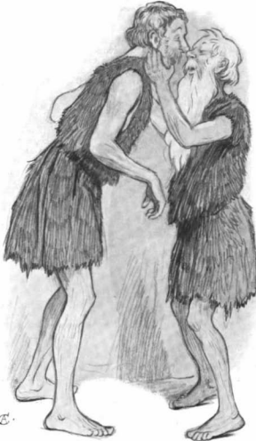
"Did him the honour of rubbing noses."

bone. Upon my beloved kinsman I bestow the insignia of the Order, which henceforth he shall wear around his neck as a token to all men of his valour and genius in war. I direct, further, that this mighty warrior shall be addressed as 'Ug, wearer of the Knucklebone!'"