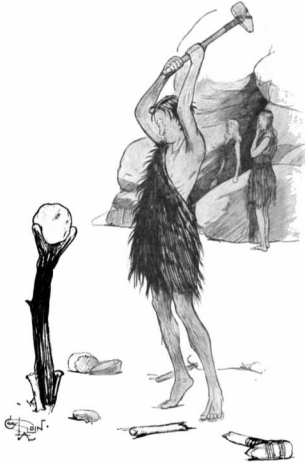
"As he went through the skull-splitting exercise."

Secondly, he dwelt upon the entente which had lately prevailed between the Sux and Muk tribes. The Muks, he argued, would be unprepared. His third reason old Sux kept to himself. The Muks were rather short of young women, and the Chief felt it