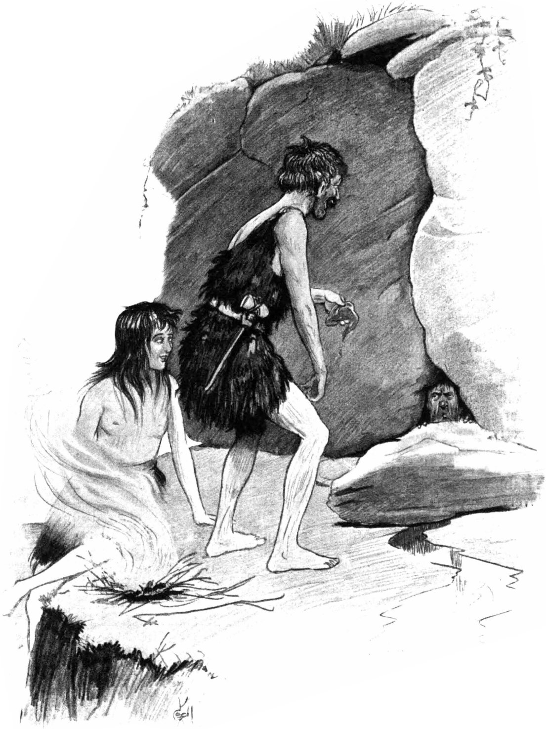
"Ug and Zug often picknicked outside the cave."

tossing and twisting on his circular couch, consumed by a natural craving to assassinate Fug. But the tribal laws were strict, and his rival had given him no provocation that the chiefs would consider adequate. Old Sux had the clearest right to dispose of a daughter to the best advantage, yet Ug, as a landlord, glowed with resentment at his inability to evict Fug. The cave was his own property, and he anticipated, by thousands of years, the natural privileges of the landlord. The expedient of warning old Sux against the