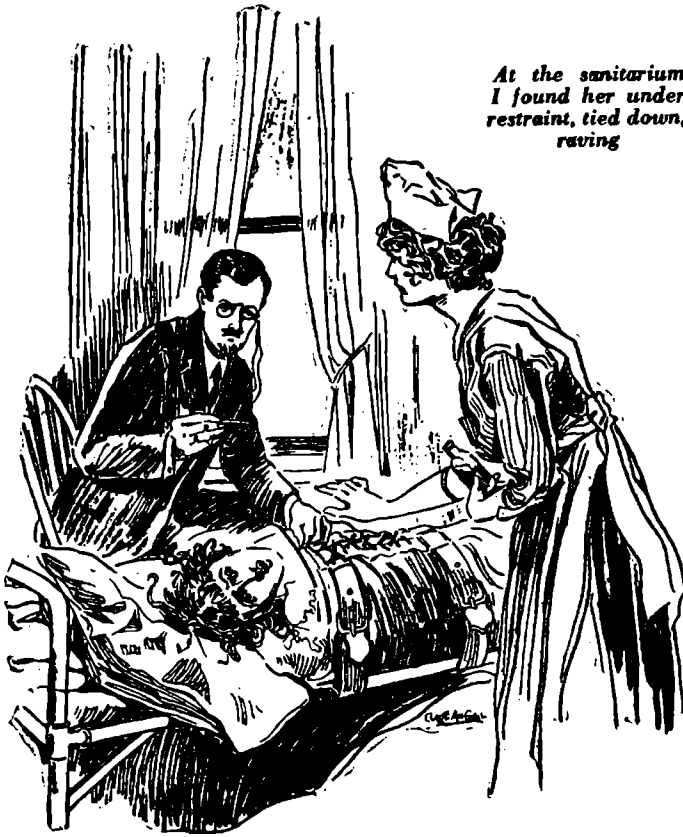
At the sanitarium I found her under restraint, tied down, raving

at my shoulder; their numbers were growing momentarily.