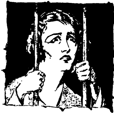
The bars were strong and heavy, yet they were pulled and twisted apart . . . .

April 23. All this occurred a week ago. Yet I am still shaking, still unnerved, to think what would have been if Emily had not answered, in the desperate courage of love, the call she believed she heard.