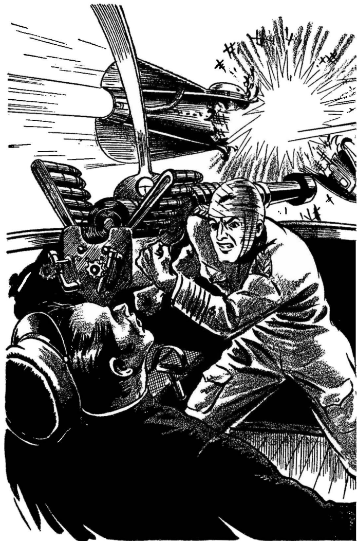
Herrick leaped forward and put all he had behind a surprise blow