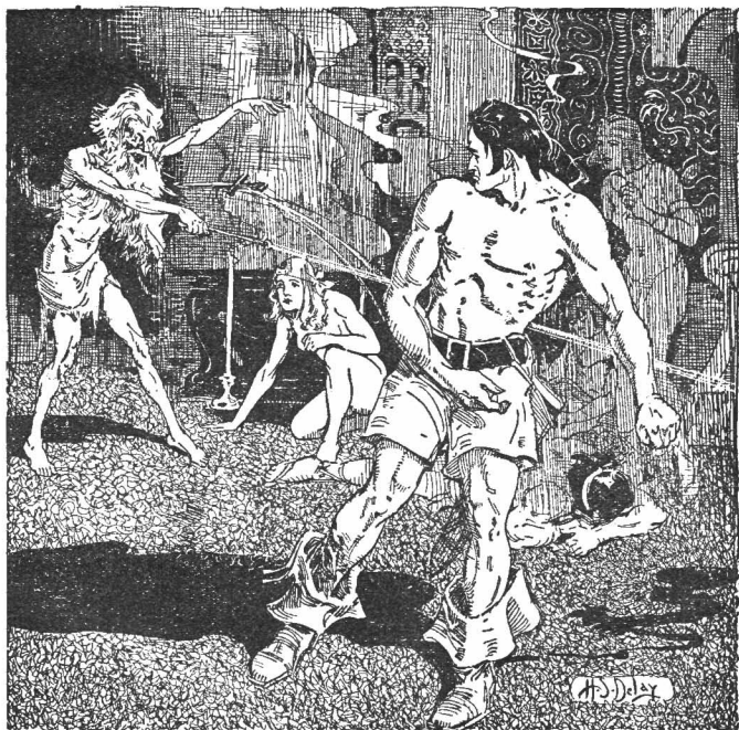
"Even as he shifted, he hurled the knife."

"But afterward?" pursued the other. "After we have slain them all? Will it